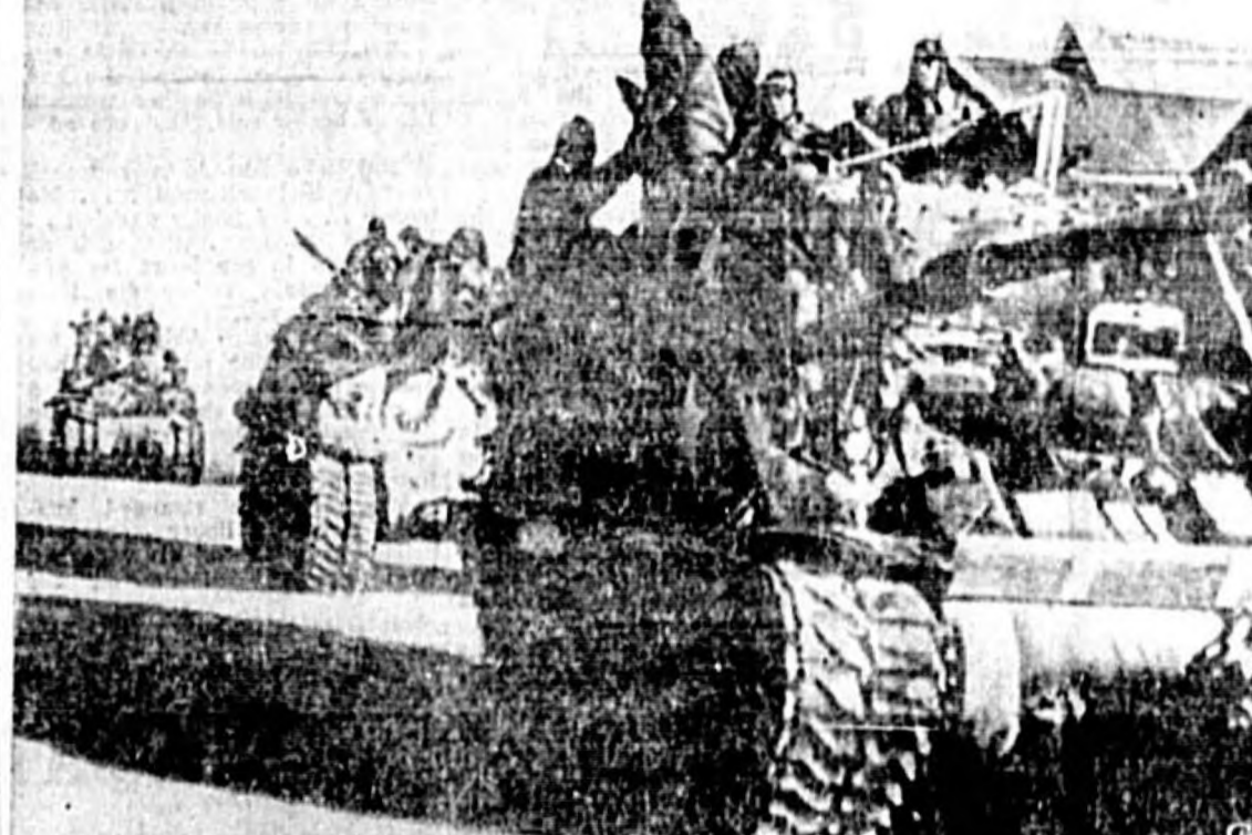
AMERICAN EVALUATION OF PYONGYANG is completed as these heavily clothed G.I.s bring to tanks of the unit to leave the burning, former Korean Red capital. Hordes of Red troops moved to behind withdrawing United Nations forces, who traveled southward in orderly fashion. Ahead of the G.I.s, infiltrated Communist guerrillas lashed at the routes over which the Allies are slowly moving.