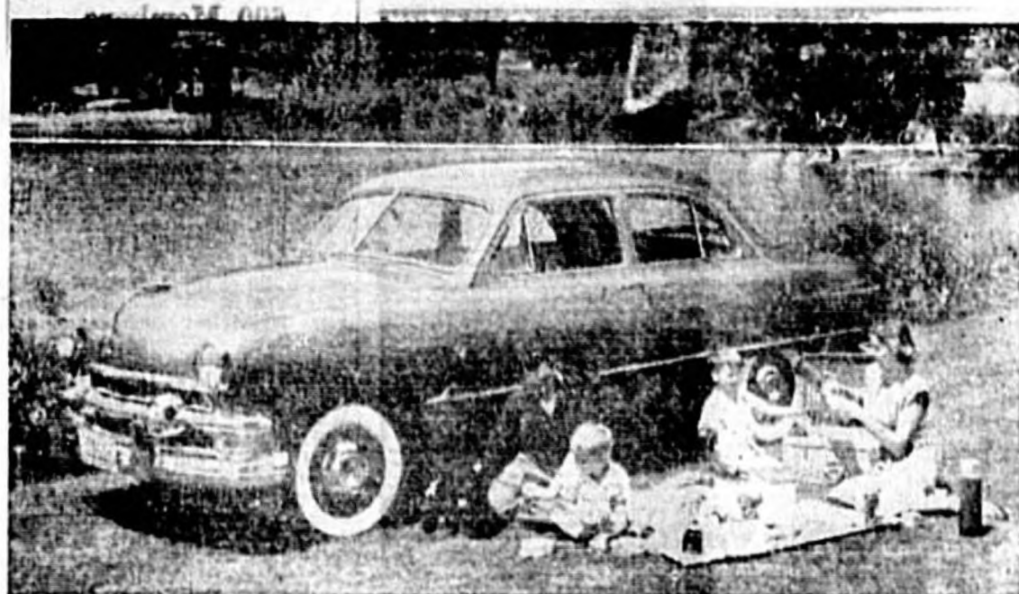
Ford passenger cars for 1951 offer refinements in appearance as well as in mechanical operation, featured by Fordomatic Drive automatic transmission. Above is pictured the 1951 Ford Custom Tudor Sedan.