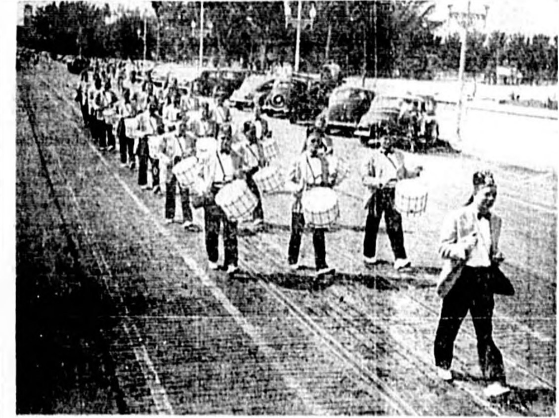
Egypt Temple's crack band, drum corps and pained will participate in the 1951 Festival of States Parade in St. Petersburg Nov. 19 which has been designated Marine Day. The famed uniformed band of Egypt Temple will make up a division of the live Festival of States Parade. Shriner will present their all star Musical Show that evening at Lang Field.