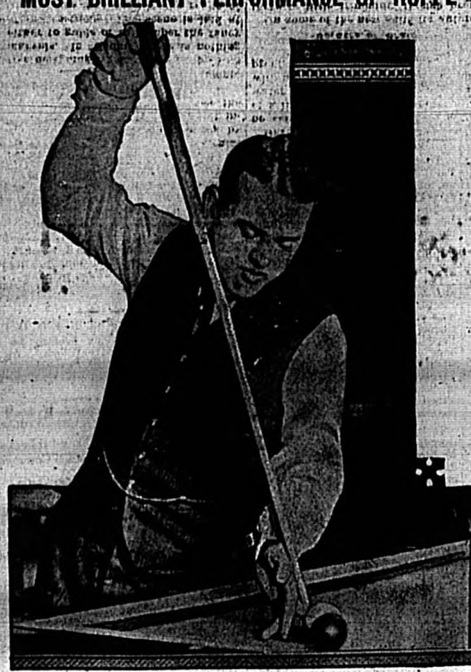
WILLIE HOPPE, BILLIARD CHAMPION OF WORLD.