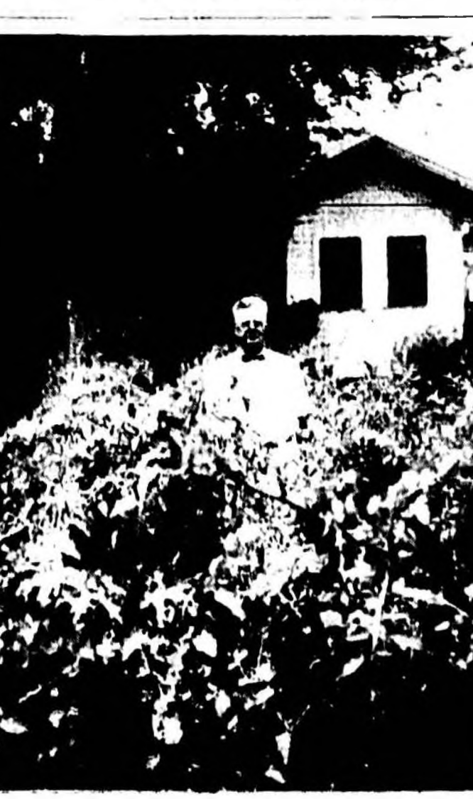
Tomatoes in the garden at home at 100 West First Street, Sanford, Fla., are growing tall and producing a bumper crop.