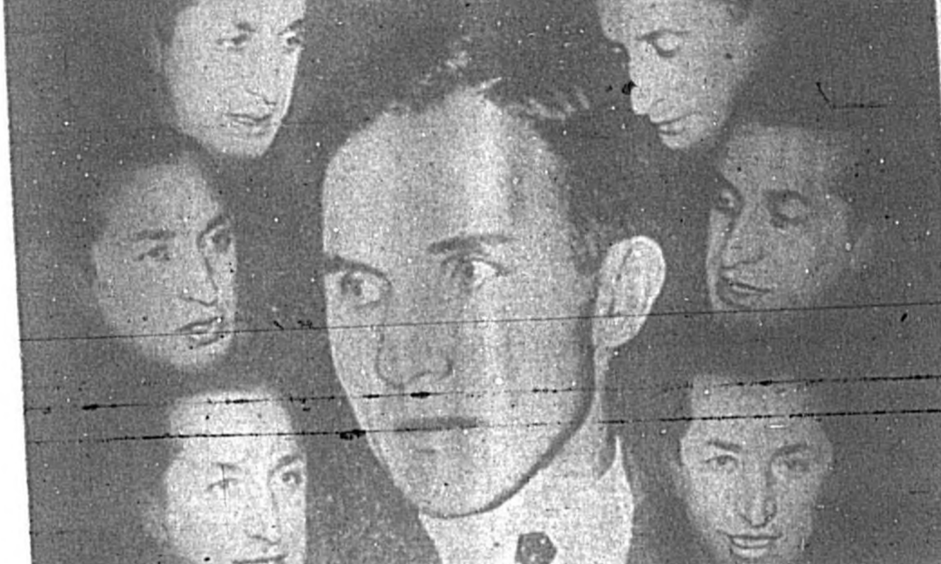
On the left, Bruno Hauptmann on trial at Flemington, N. J., today. In the center, the jury. On the right, the judge. The trial is the most sensational in the history of the state.

The state worked toward the climax of the case today when the testimony of the kidnap ladder was heard. The testimony was given by a man who had been seen in the vicinity of the crime scene. He testified that he had seen a man who he believed was Hauptmann, and that he had seen him in the vicinity of the crime scene. The evidence was built from meager clues of crime, and the prosecution case against Hauptmann is based on the evidence that was developed in the trial.