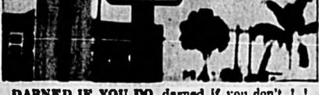
DARNED IF YOU DO, darned if you don't!! Motorists meandering on Palmetto Avenue near the post office ponder this puzzle posted on a lone pole. That "does she or doesn't she" idea could be used here.