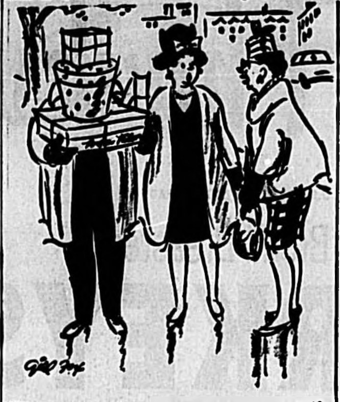
"Well, it's been nice meeting your husband. You know, he reminds me a lot of my George."