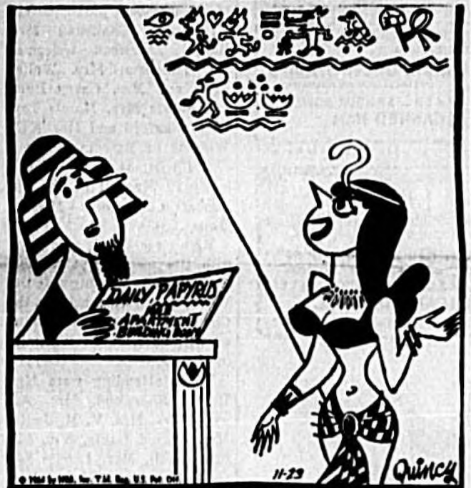
"They sure don't build pyramids like they used to! I can hear the family next door talking!"