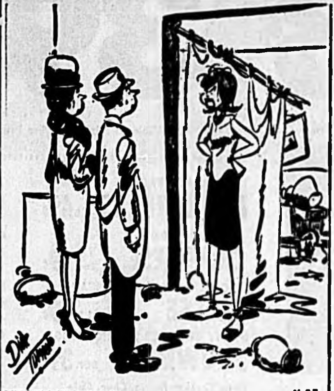
"Your Junior went to his room just as soon as you left. It seems that's where he keeps his house-wrecking equipment!"