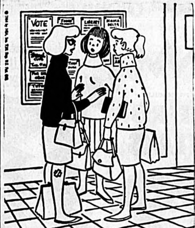
"If you ever baby sit the Bailey kids, have your mother phone every half hour to make sure you're all right!"