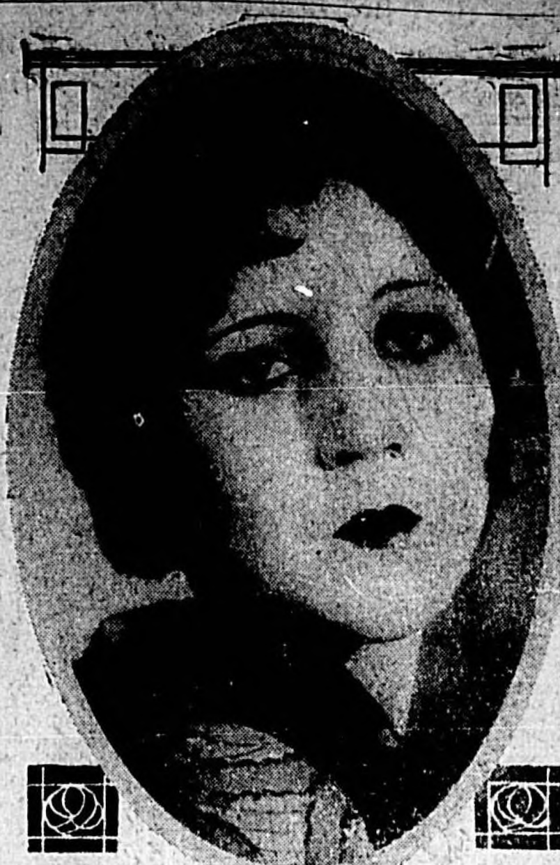
Publicity men choose Olive Borden as 1925's most promising product of pulchritude. She's one of 14 choices. Never mind the rest. Yes, she's from Hollywood, too.