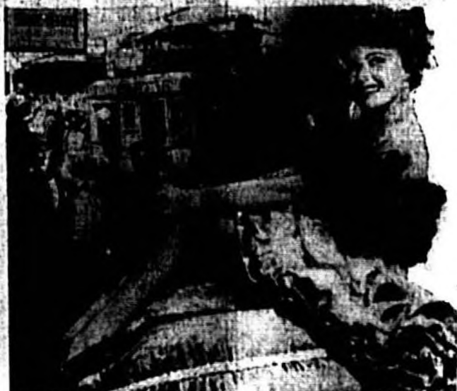
Paramount's beautiful Frances Gifford supplies the romantic interest in "Tomstone," starring that hit-man favorite, Richard Dix, part of a double bill program at the Ritz tomorrow.