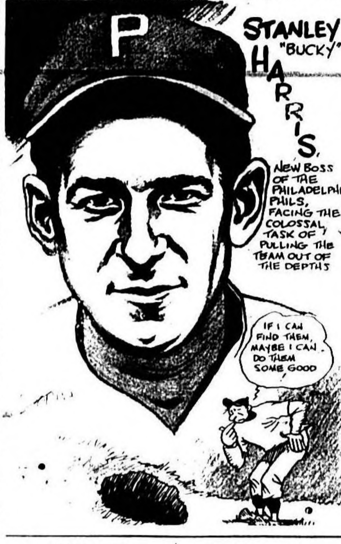
STANLEY HARRIS NEW BOSS OF THE PHILADELPHIA PHILS, FACING THE COLOSSAL TASK OF PULLING THE TEAM OUT OF THE DEPTHS

IF I CAN FIND THEM, MAYBE I CAN DO THEM SOME GOOD