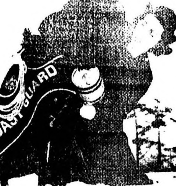
SECOND CLASS SEAMAN... The pup weighs 163 pounds, without his harness