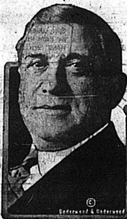
This is the most recent portrait of Charles M. Schwab, the steel magnate, who has just celebrated his fifty-eighth birthday.