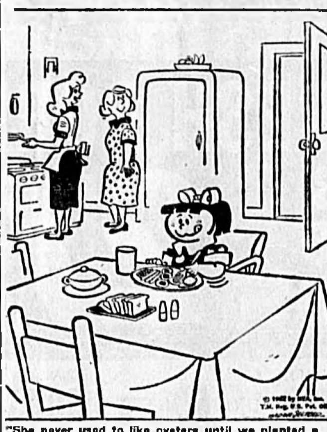
"She never used to like oysters until we planted a pearl in one!"

12. Real Estate For Sale A FABULOUS buy, 4 bedroom masonry home, stone fireplace, open beam construction, 2 tile baths, 100 x 600 feet on beautiful Lake Markham. Must see to appreciate. FA 2-3378.