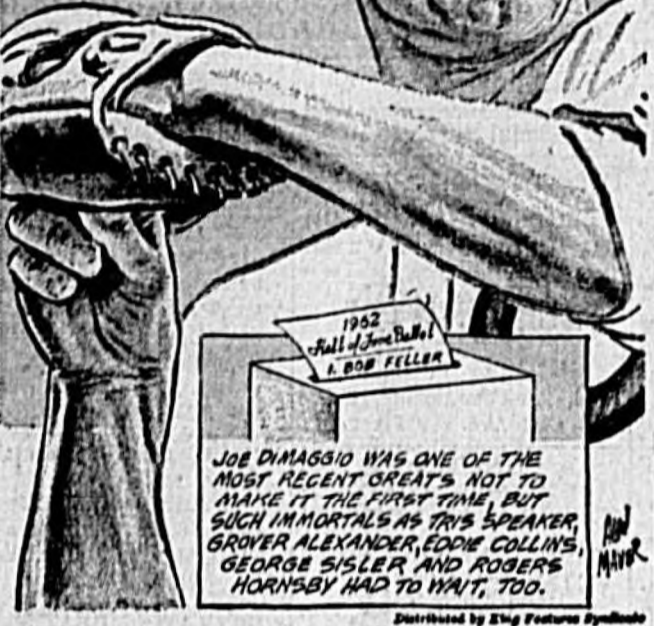
JOE DIMAGGIO WAS ONE OF THE MOST RECENT GREATS NOT TO MAKE IT THE FIRST TIME, BUT SUCH IMMORTALS AS TRIS SPEAKER, GROVER ALEXANDER, EDDIE COLLINS, GEORGE SISKLER AND ROGERS HORNSBY HAD TO WAIT, TOO.