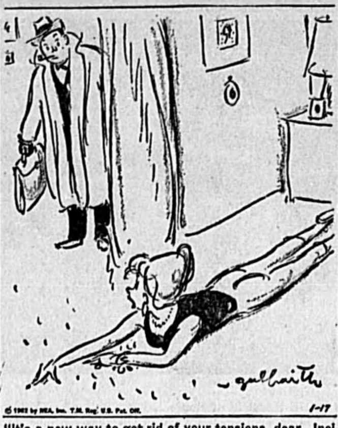
"It's a new way to get rid of your tensions, dear. Incidentally, I didn't realize how shabby this rug looks!"