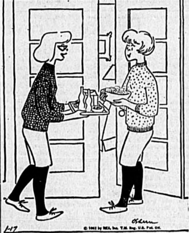
"Gee, I'd love to baby-sit Caroline Kennedy. I bet the White House refrigerator is really loaded!"