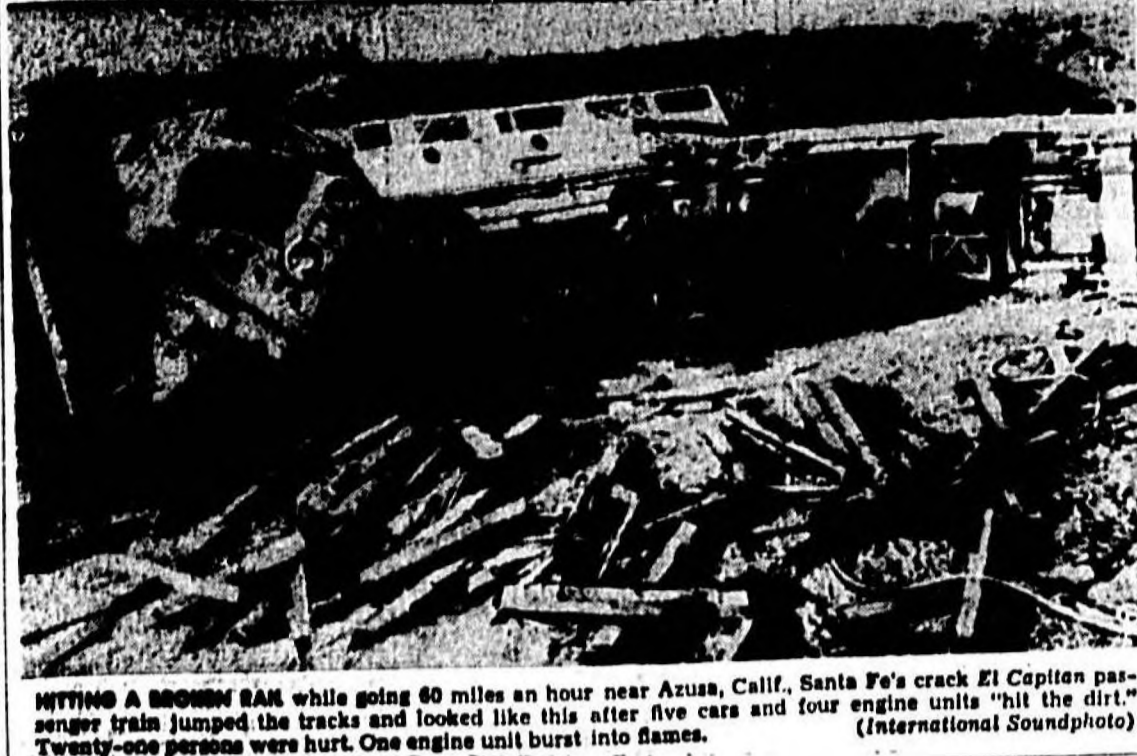
MYTING A BURNING BAN while going 60 miles an hour near Azusa, Calif. Santa Fe's crack El Capitan passenger train jumped the tracks and looked like this after five cars and four engine units 'hit the dirt'...