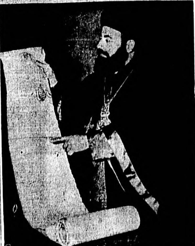
ARCHBISHOP AND METROPOLITAN of Jerusalem and Trans-Jordan, the Rev. Athanasius Yeshua Samuel is shown in Washington with one of three ancient Hebrew scrolls believed to be more than 2,000 years old.