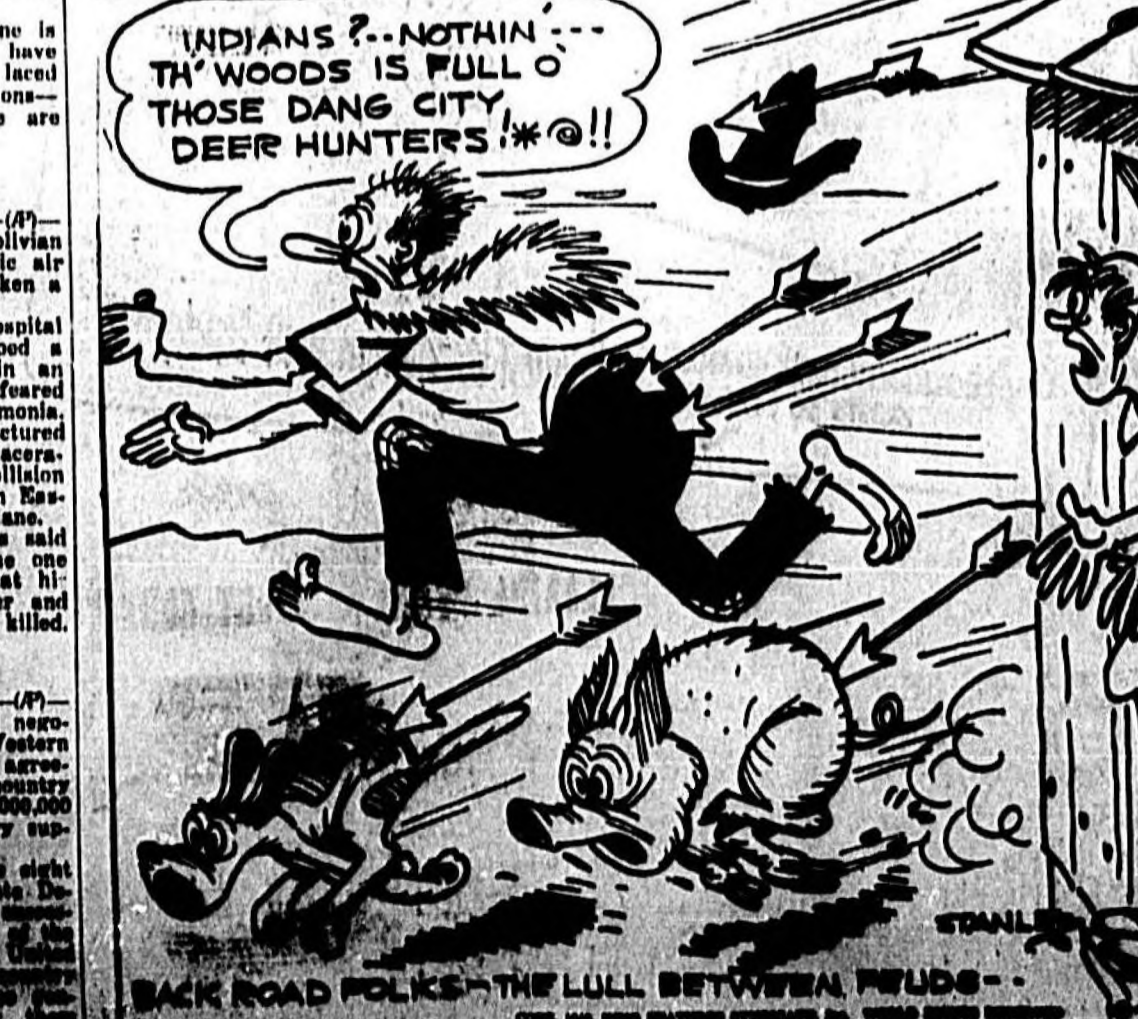
BACK ROAD POLICE—THE LULL BETWEEN FEUDS—