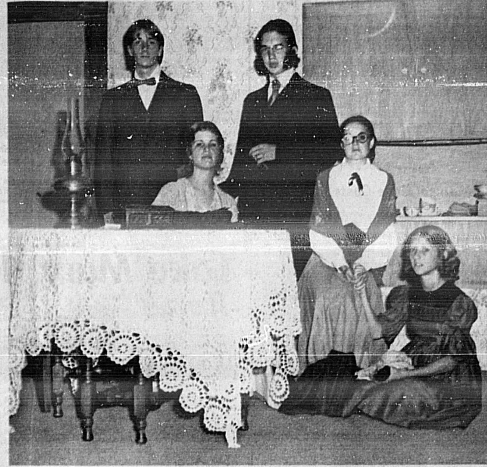
Portrait of a Famous Family. Tonight is opening night for "The Miracle Worker," a play which dramatizes the miraculous story of blind mute, Helen Keller, presented by Sanford's Fellowship Players in the First United Methodist Church Hall at 8 o'clock and again Saturday and Sunday nights at the same time.