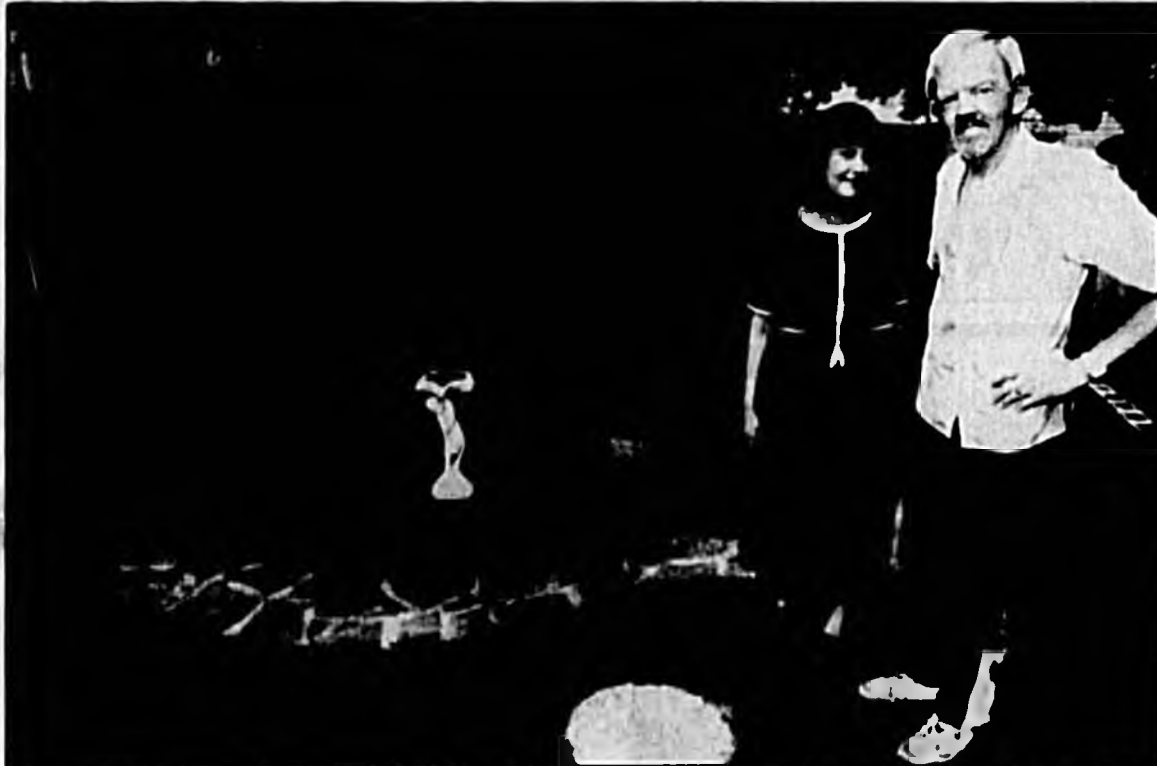
Michael Van Dyke, right, created an environmentally safe garden, complete with a goldfish pond and fountain, for Laurel Swindle, who was diagnosed with breast cancer seven years ago.