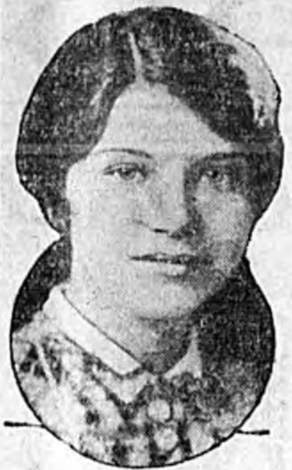
Theater parties and dinner dances are quite antique these days. Miss had by all.