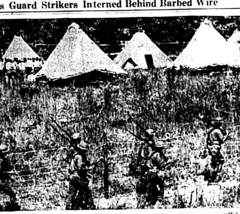
Troops Guard Strikers Interned Behind Barbed Wire

HOUSTON, Sept. 20.—(AP)—Officials of the Morgan Steamship Line announced today that a large store of dynamite connected to a battery and alarm clock had been found in the company's docks on the Houston ship channel.