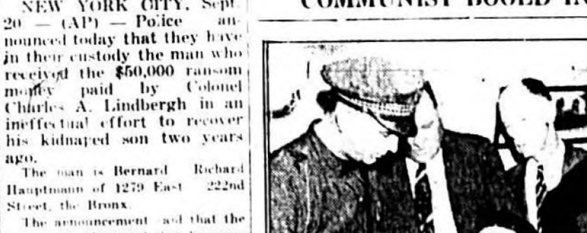
Man Was Driving Car Stolen Night Before

NEW YORK, Sept. 20.—(AP)—Police announced today that they had in their custody the man who received the $50,000 ransom money paid for the abduction of Lindbergh in an effort to recover his kidnapped son two years ago.