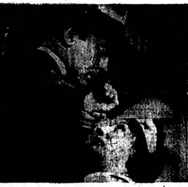
Overpowered! Dennis O'Keefe arrives just in the nick of time to prevent Judith Anderson from committing another crime in "Lady Scarface", which will be shown as part of a double feature program tomorrow and Saturday at the local Ritz.