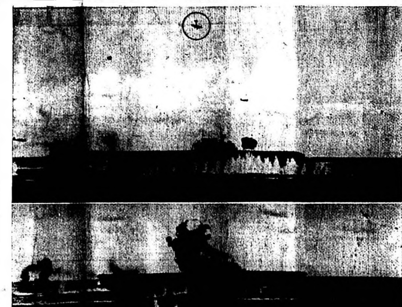
These unusual official U.S. Navy photos show (top) several Jap planes above the U.S. Navy aircraft carrier Hornet during the Battle of Santa Cruz. The plane in the circle is the one piloted by the Jap suicide pilot who crashed his craft on the deck of the carrier. The Hornet, mortally wounded, did not sink until it was sent to the bottom by U. S. surface craft. The bottom photo shows the Japanese dive bomber, aimed on a suicide plunge, hitting the signal tower of the carrier.