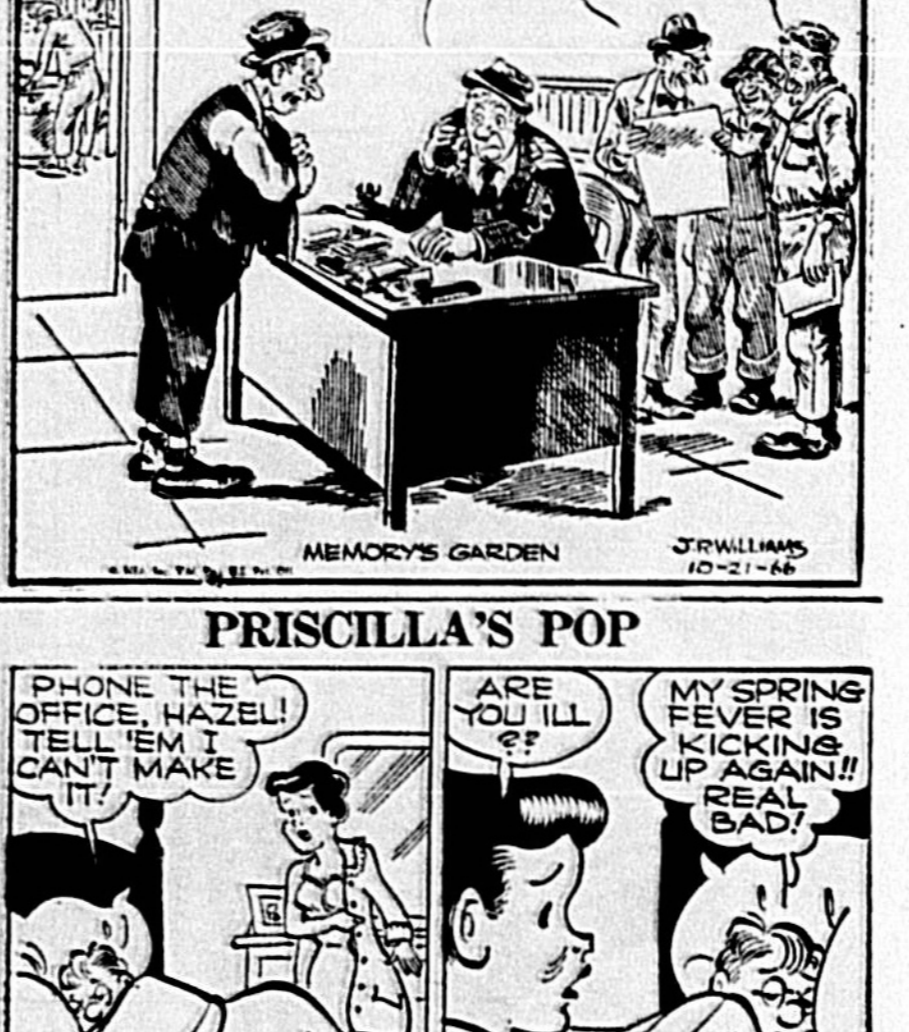
"WAIT! YES, I FEEL A PAPER DOWN IN MY VEST. I'LL GET THAT AN' WELL GO TOGETHER!"