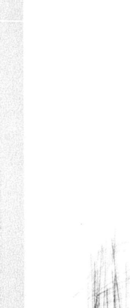
"URK! I PAID GOOD MONEY FOR THESE GIMMICKS, BUT THEY AIN'T MUCH FUN!"