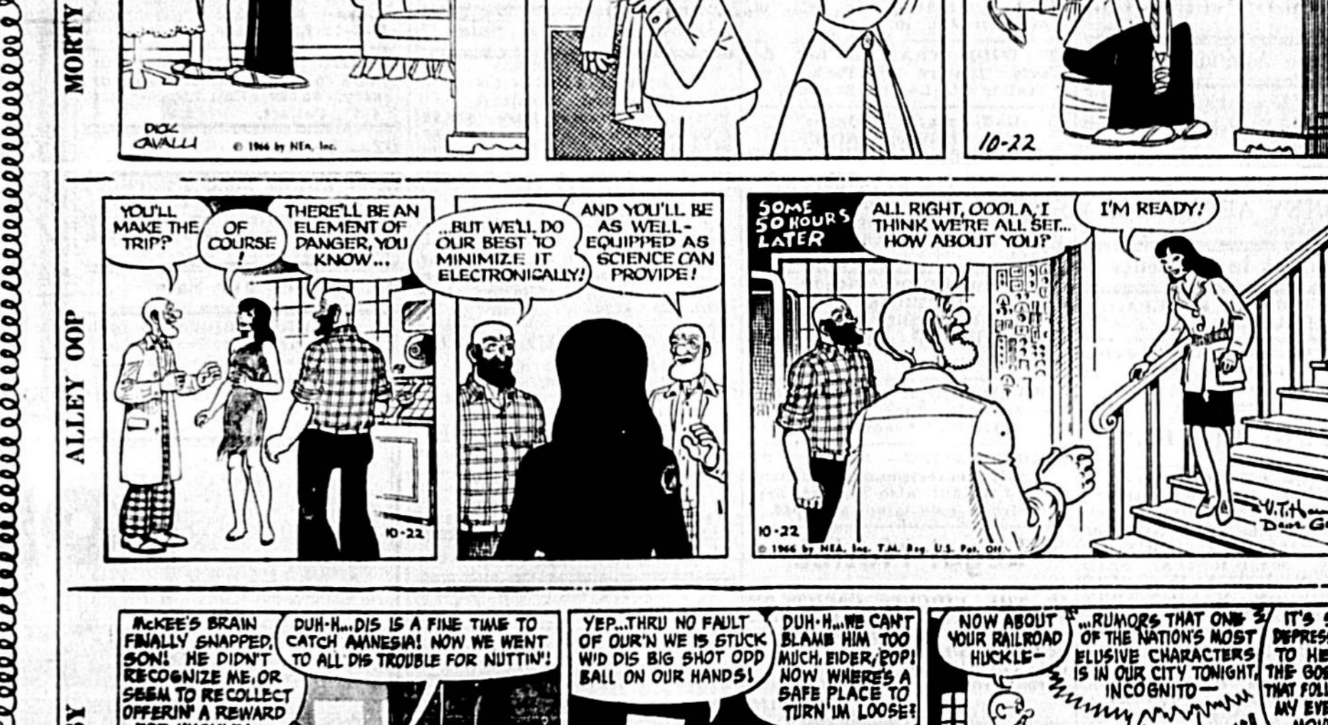
"DAD MAY I HAVE YOUR CLASSICAL RECORDS OF VOICES?"