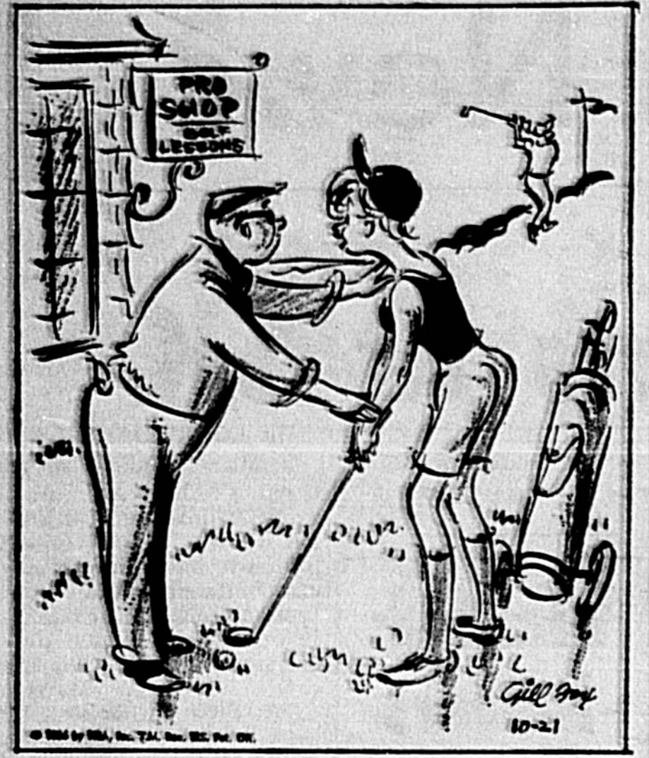
"I'm really not mad for golf. It's just that we need a few trophies to sort of dress up the house!"