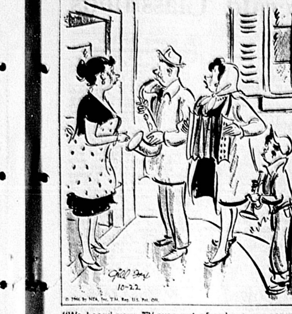
"We heard your TV was out of order, you poor girl!"