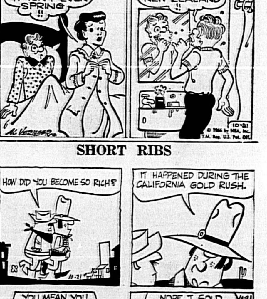
"MY SPRING KICKING UP REAL DIRT!"