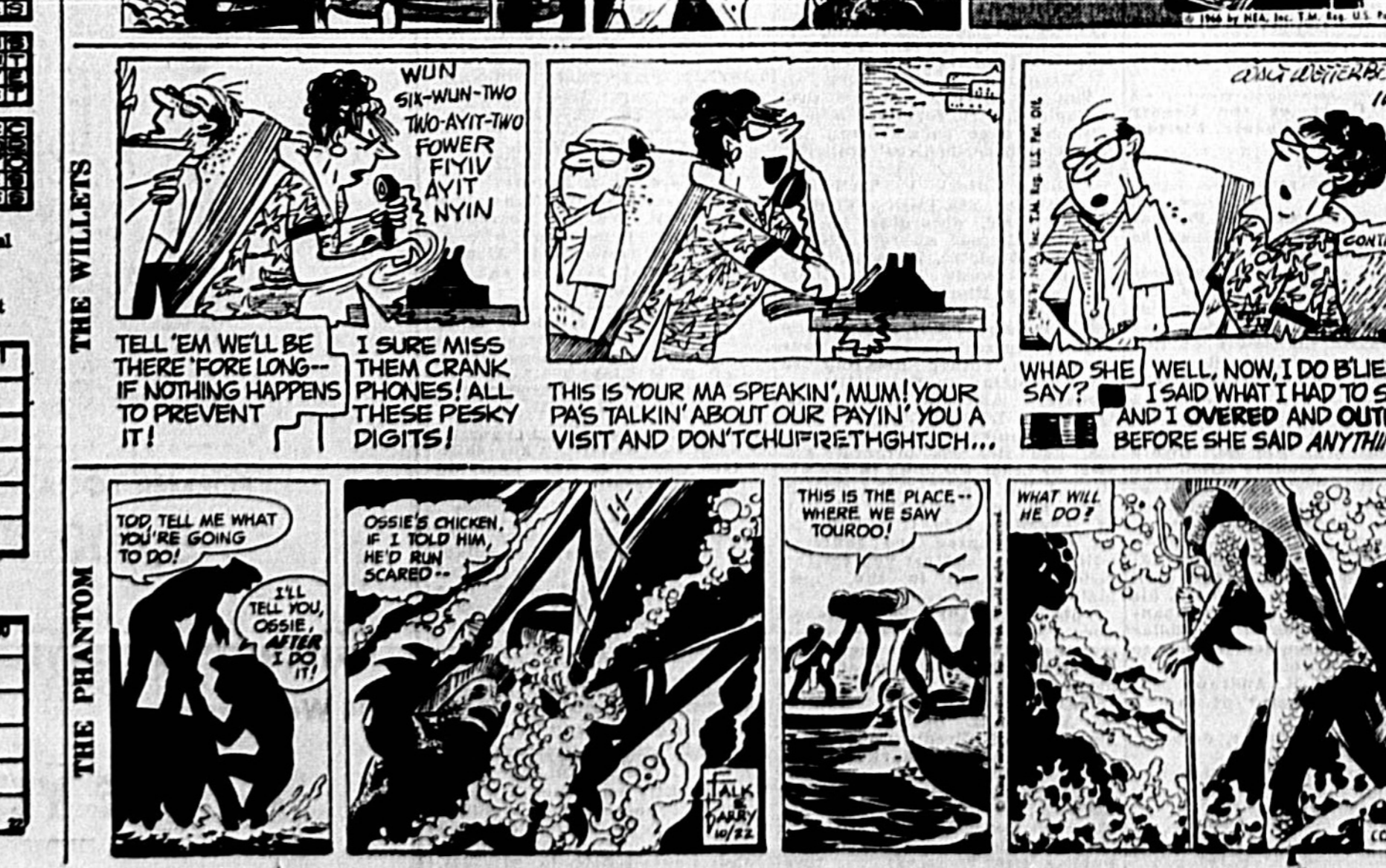
"$5 DOLLARS TO FIX THAT GET? YOU MUST BE OUT OF YOUR MIND - FORGET IT!"