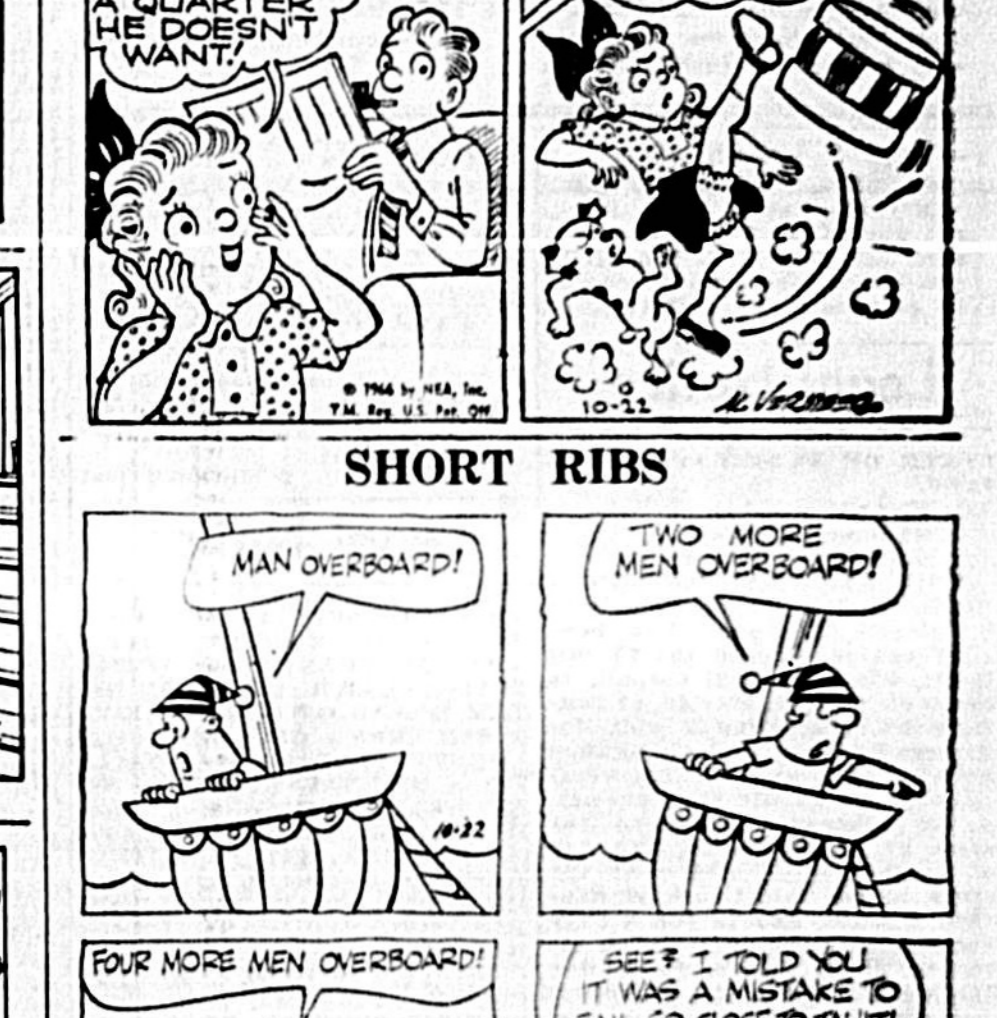
"MAYBE SOME KIND, WONDERFUL PERSON HAS HE DOESN'T WANT!"