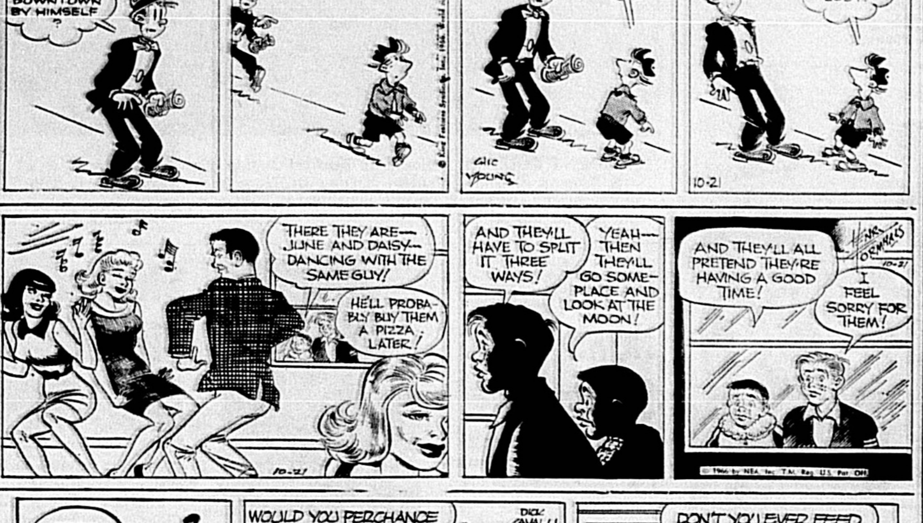
"JUST THINK - ONE MORE PRINCE AND IT'LL BE ALL OURS!"