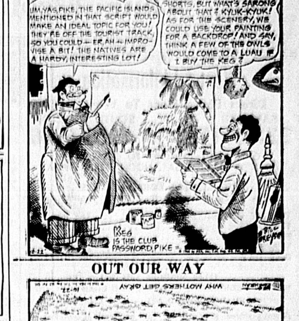
"WELL, IT'S A LITTLE COOL FOR ME, BUT I'LL TAKE IT!"