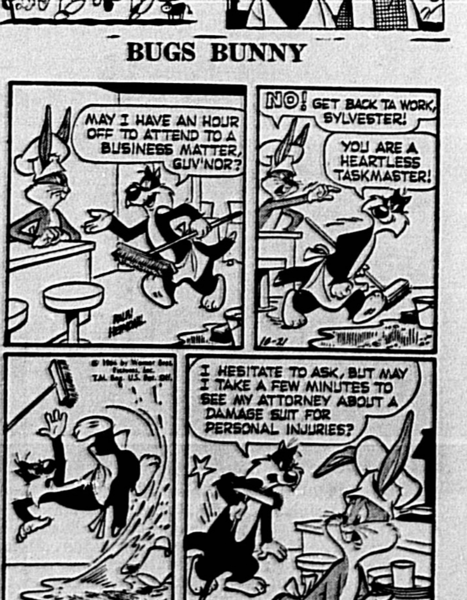
"IT HAPPENED DURING THE CALIFORNIA GOLD RUSH."