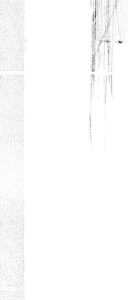
"TOD, YOU'RE TRYING TO SCARE ME!"