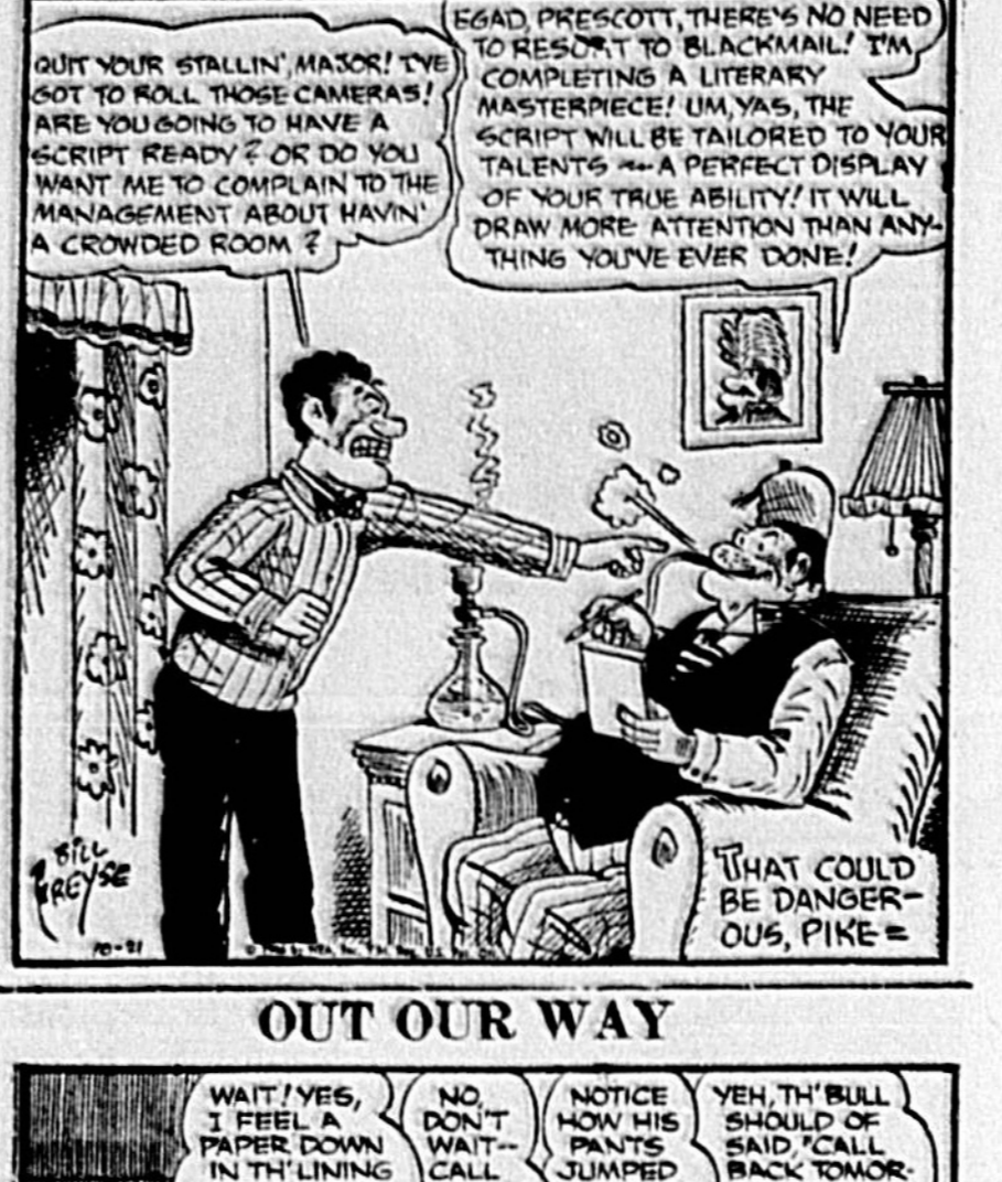
"I SAID PRESCOTT, THERE'S NO NEED TO COMPLAIN TO BLACKMAIL! I'M COMPLETING A LITERARY MASTERPIECE!"