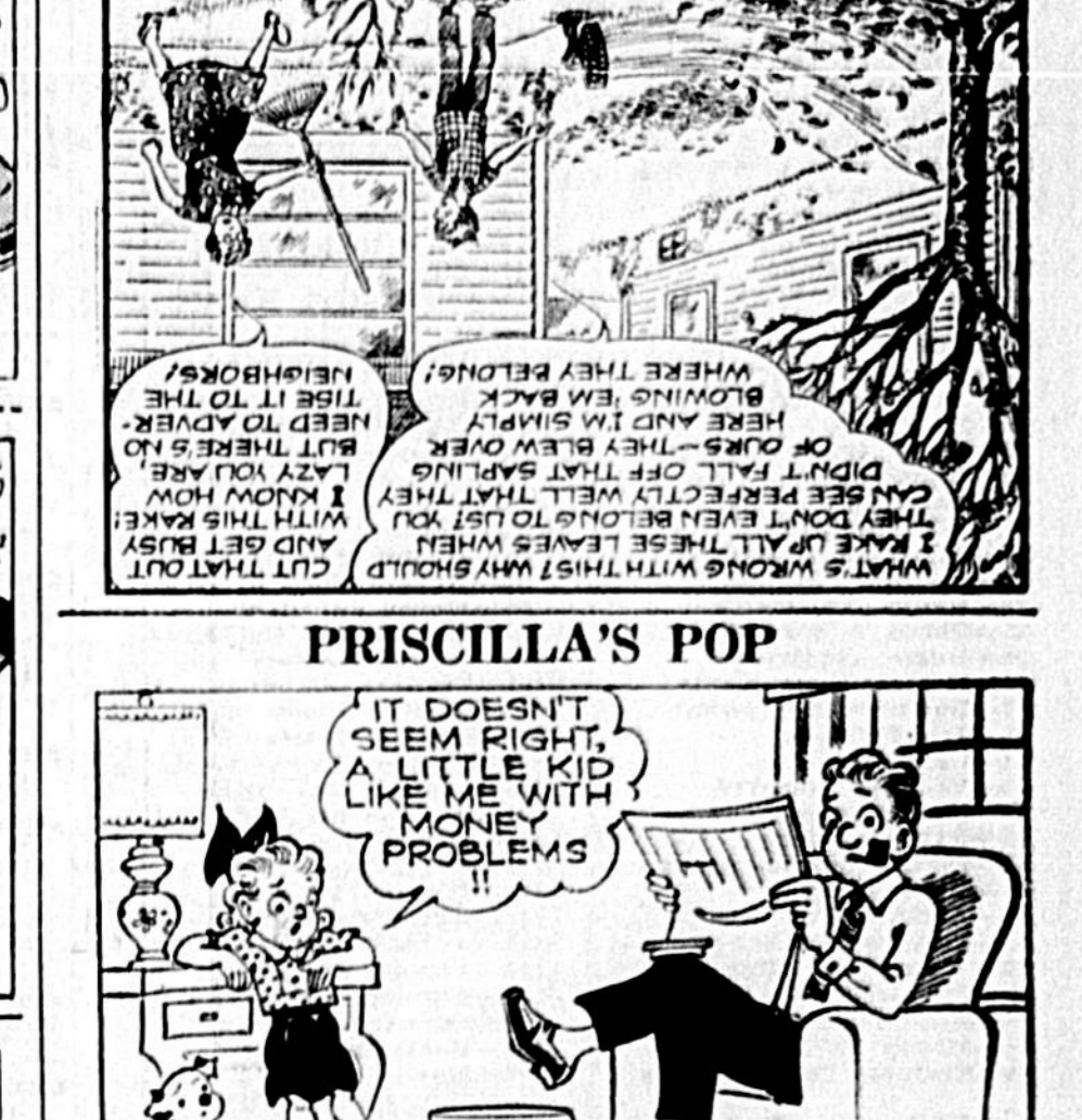
"I DON'T SEEM FRIGHTENED LIKE THE KID LIKE ME WITH PROBLEMS!"