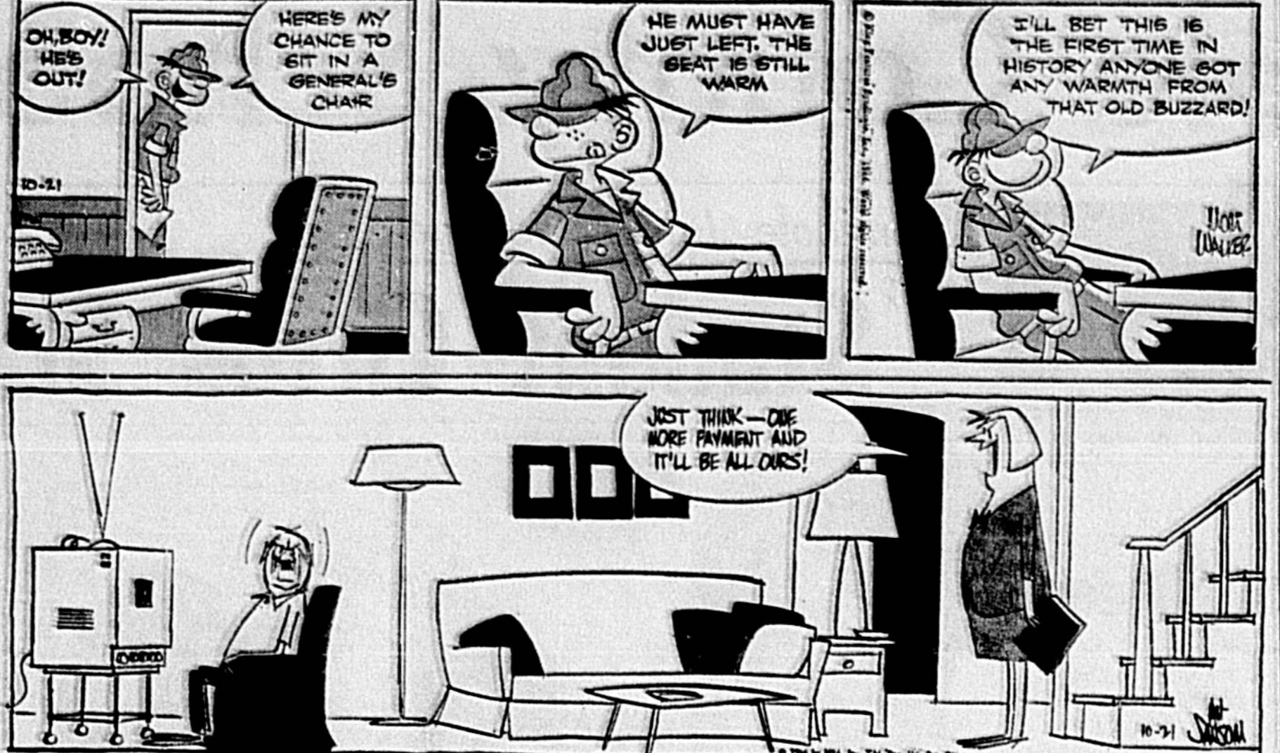
"I'll bet this is the first time in history anyone got any warmth from that old buzzard!"