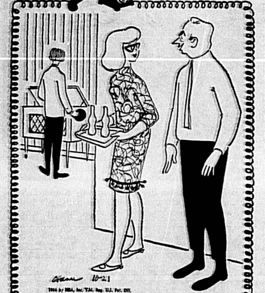
"Your date looks NORMAL! What's wrong with him?"