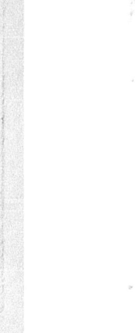
"I PAID GOOD MONEY FOR THESE GIMMICKS, BUT THEY AIN'T MUCH FUN!"