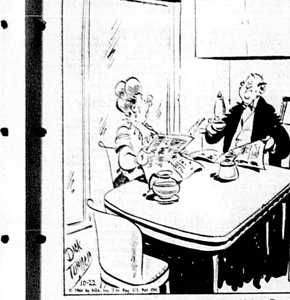
"Speaking of protest marches, I see Helen Bascomb finally got that follow of hers to the marriage license bureau!"