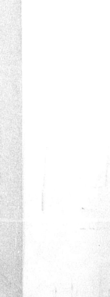
"TOD, YOU'RE TRYING TO SCARE ME!"