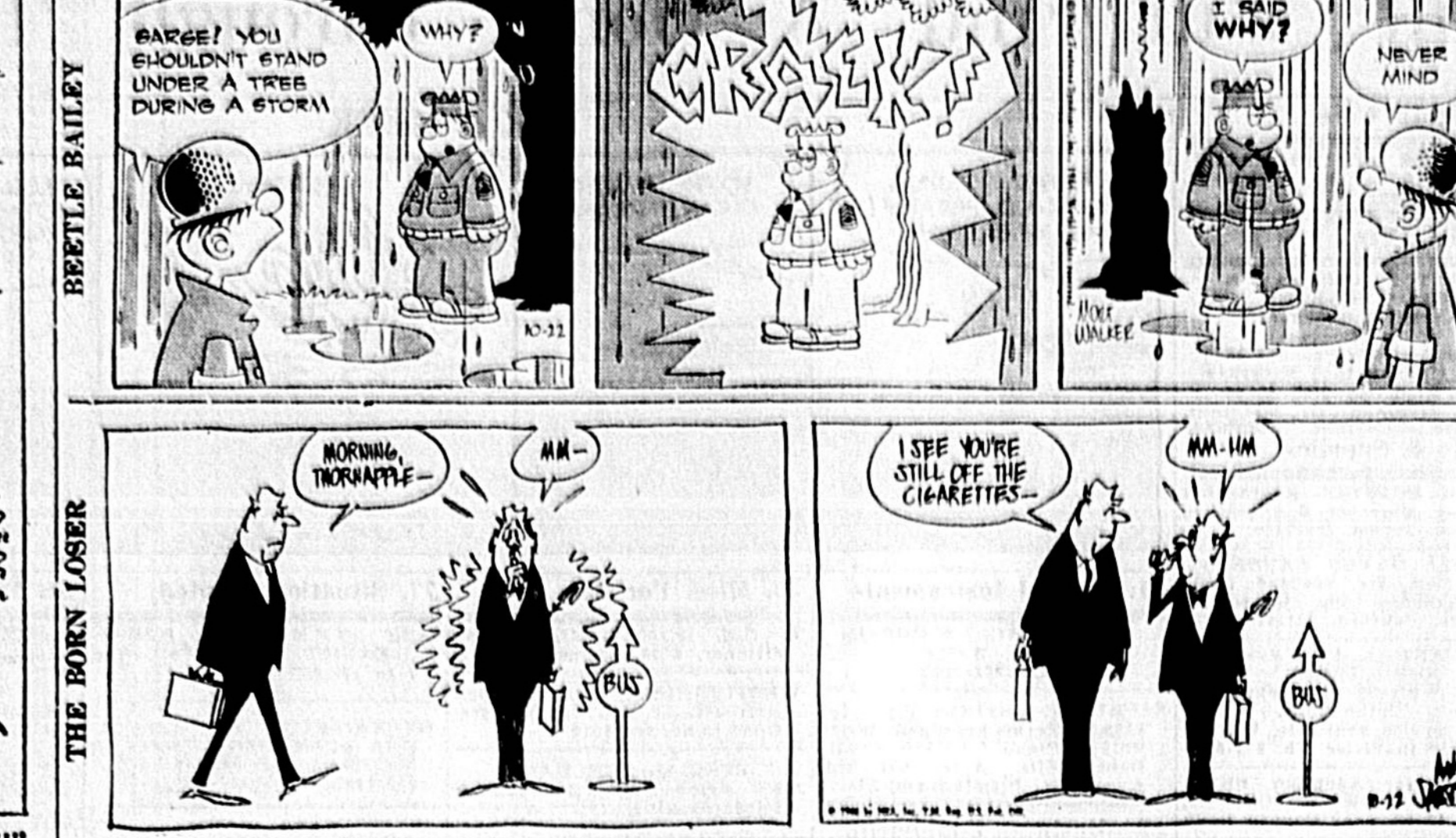
"BARGE! YOU SHOULDN'T STAND UNDER A TREE DURING A STORM!"