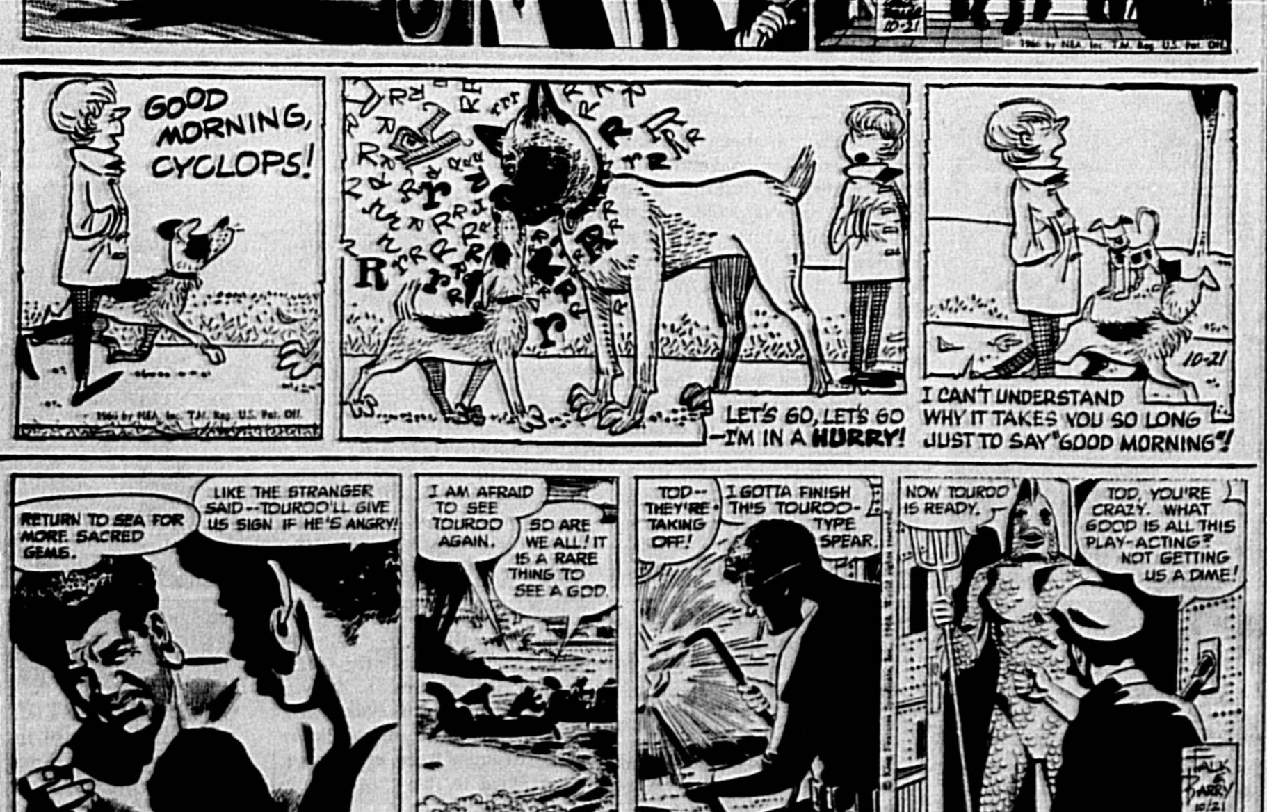
"LET'S GO, LET'S GO - I'M IN A HURRY!"