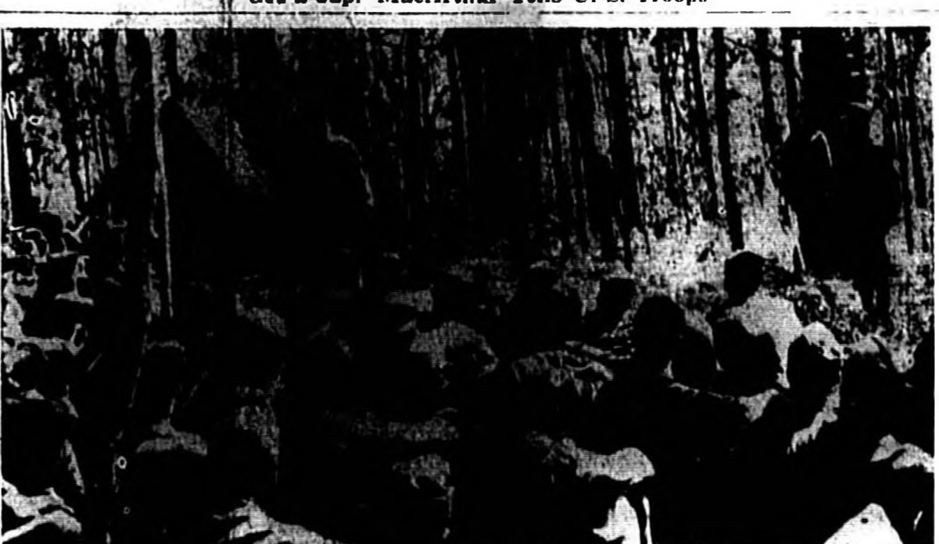
Speaking to officers of a U. S. division under the trees somewhere in Australia, General Douglas MacArthur instructed them to "Get a Jap" each American soldier as the Pacific war front to "Get a Jap." It was disclosed that MacArthur visited New Guinea the other day, where Allied Nations troops are advancing across the Queen Stanley Mountains. Enemy resistance is said to be slight. This is a photograph.