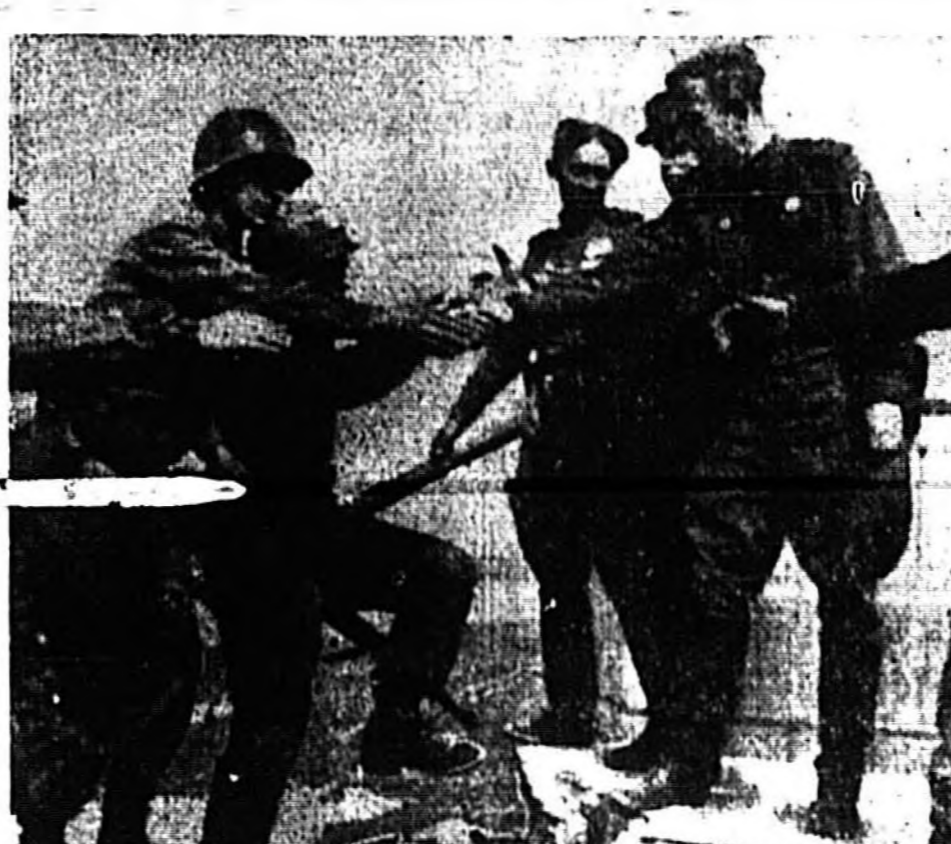
FIRST ARMY INFANTRYMEN (left) meet with Russian soldiers (right) on a broken bridge spanning the Elbe River at Torgau, Germany, following the historic linking of American and Russian forces.