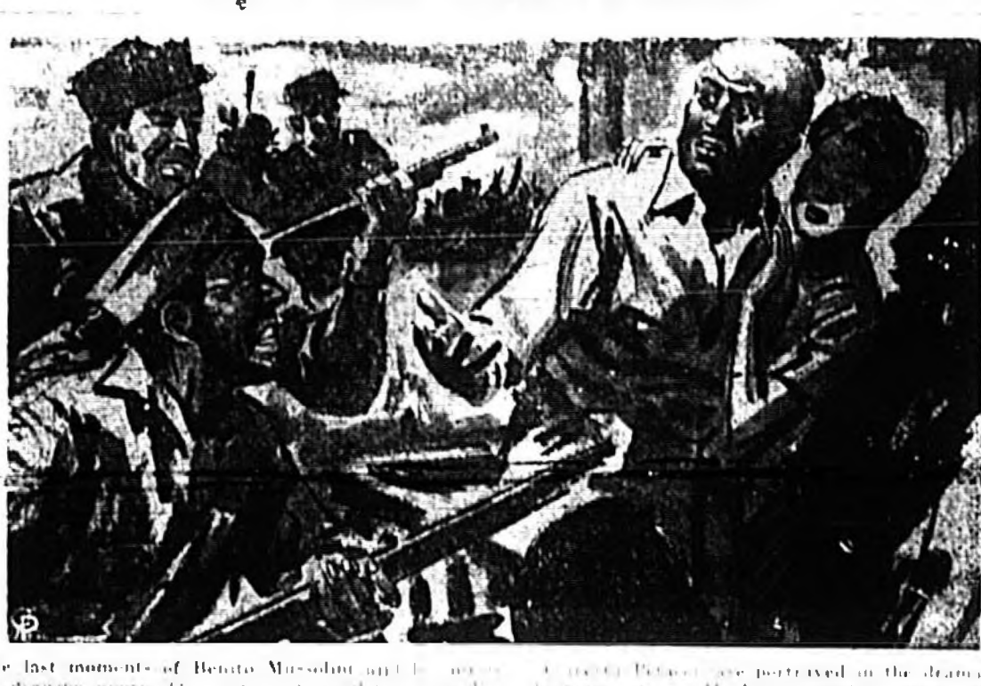
The last moments of Benito Mussolini and Adolf Hitler are portrayed in the dramatic drawing above. The drawing is by the artist, ... (Continued on Page Two)