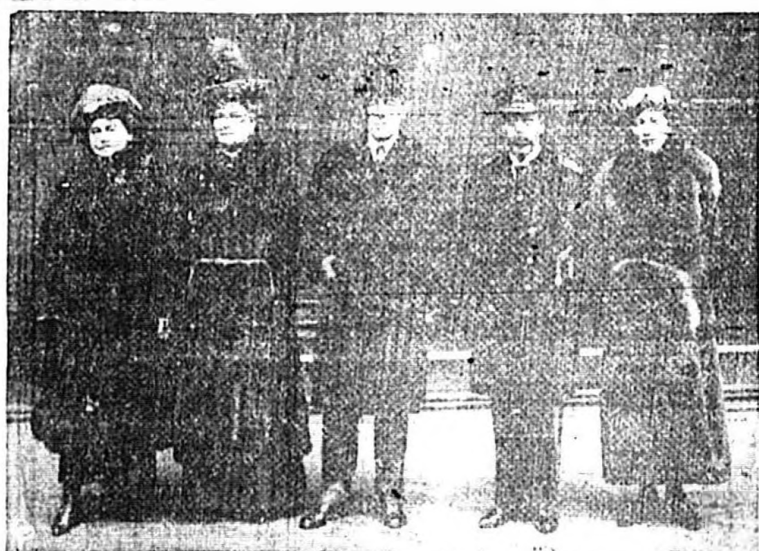
In December, 1918, when President and Mrs. Woodrow Wilson stopped in London during the president's journey to France to participate in the League of Nations conference, the above photo was taken showing left to right, Mrs. Wilson, Queen Mary, President Wilson, King George V, Princess Mary.

Continued From Page One Individual housing units, which will allow officers and enlisted men to live with their wives and families during their limited stay in the country, will be used to cover some such difficulties.