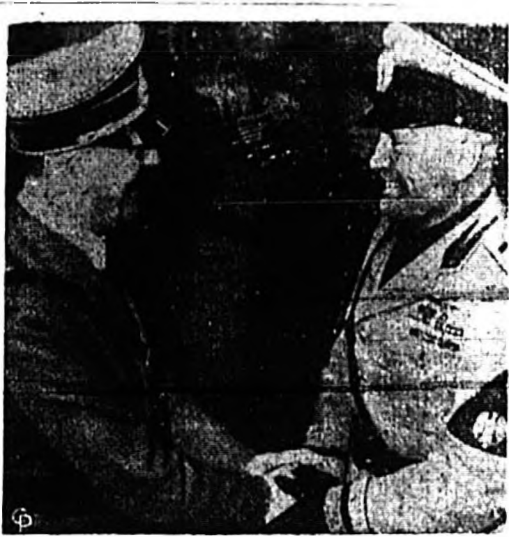
After Mussolini and Hitler had decided to link their destinies, the two dictators met frequently at the Brenner Pass at the Italian-Austrian border to discuss the fortunes of war. Here they are shown as they shake hands and exchange greetings in October 1940. Both are now reported dead.