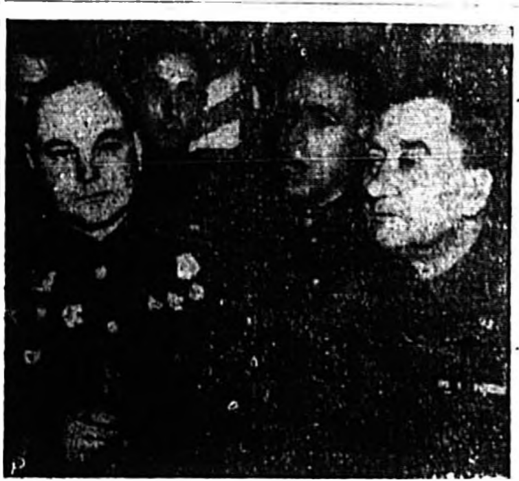
FOLLOWING THE HISTORIC LINKING OF American and Russian forces at Torgau, Germany, the commanding general of the Russian 58th Infantry Division prepares to drink a vodka toast celebrating the historic occasion.