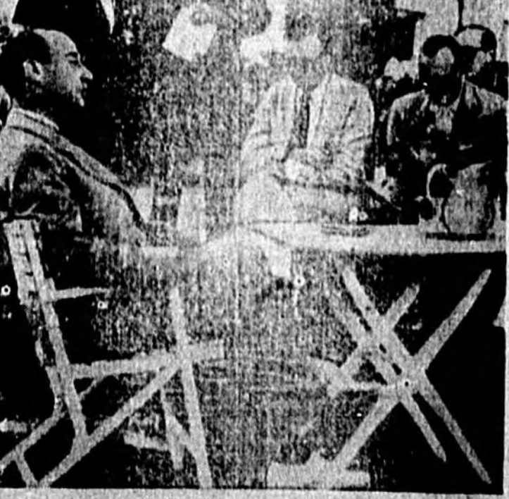
ON THE LAWN of the Governor's Mansion in Springfield, Ill., Gov. Adlai E. Stevenson (left) holds his first conference with the press since his nomination.