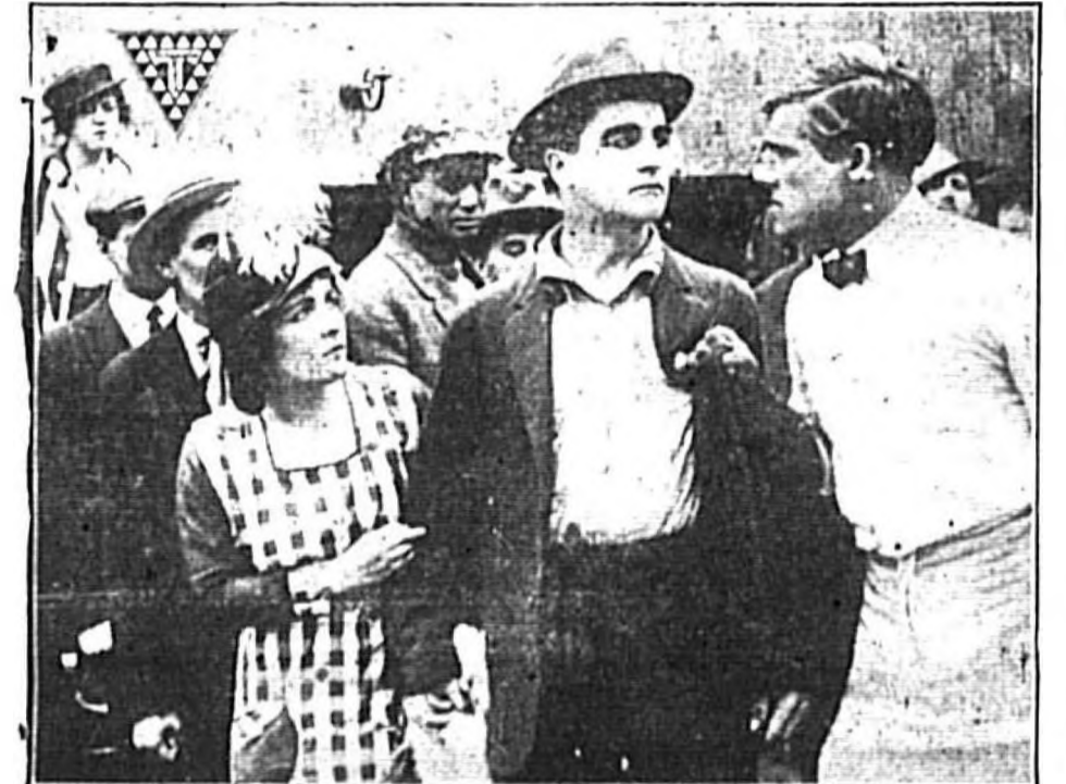
JANE GREY AND WILLIAM DESMOND, THE TWO TRIANGLE-INCE STARS IN "WAIFS"

WANTED Wanted—To buy horse and grocery delivery wagon. Will pay cash. Sorrento Market, Sorrento, Fla. 96-20