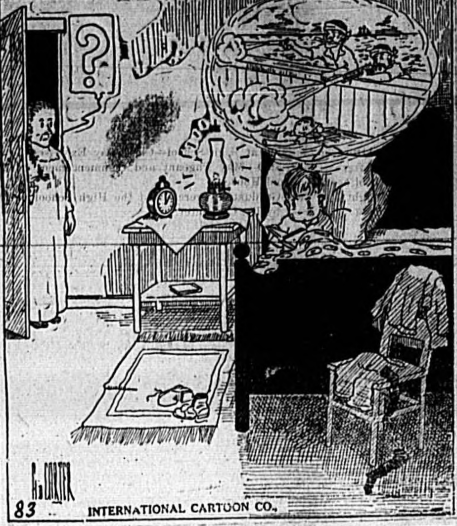
INTERNATIONAL CARTOON CO.

ings Bryan arises and introduces Will H. Hays in an eulogistic address characterizing him as "a great American, a great Christian, a great Presbyterian and a friend of the church."