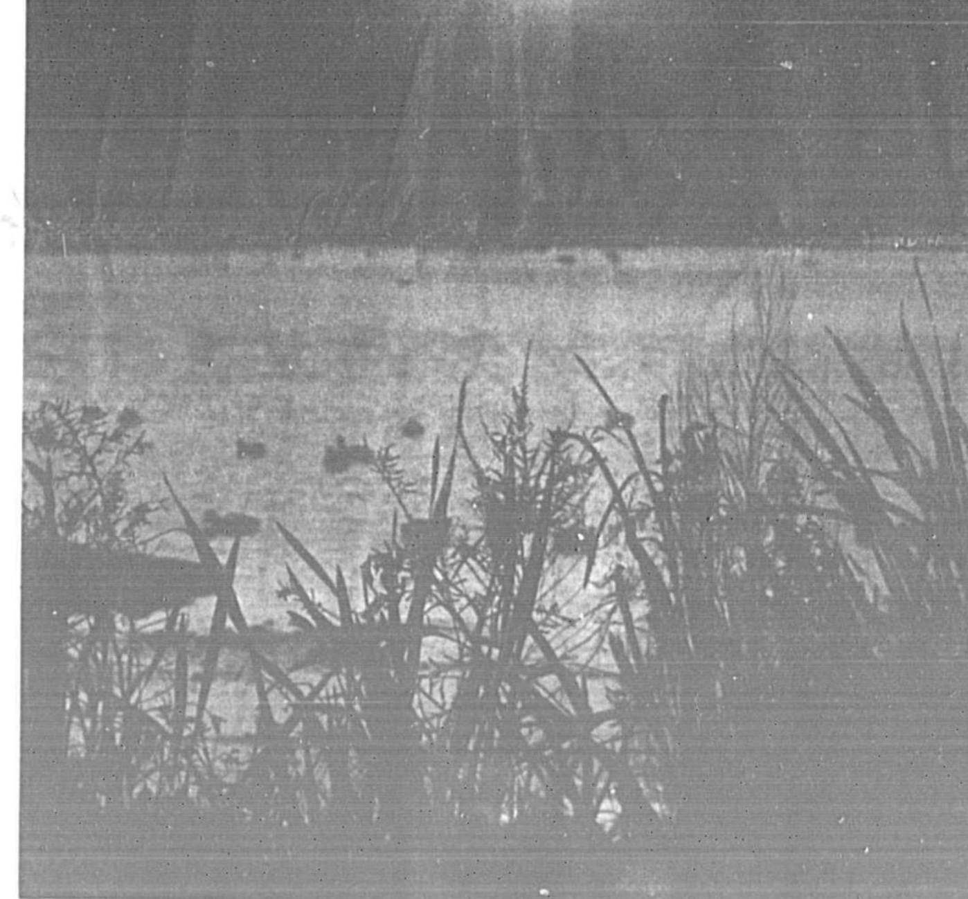
'Twas a cold dawning today on Lake Adelaide, Altamonte Springs

Seminole County today linked up with four other counties in an emergency medical service (EMS) program designed to provide better emergency services to citizens in the county.