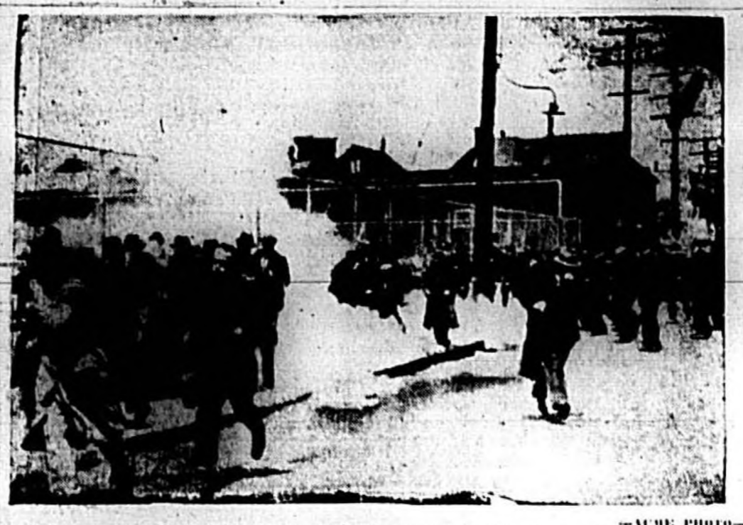
Police reserves effectively used tear gas bombs to rout striking seamen during a street fight in Everett, Mass. Note effigy in upper right corner left by the strikers.