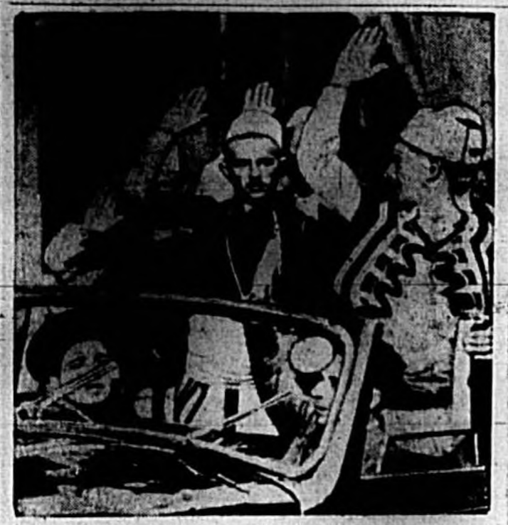
Quick to learn Italian ways, Albania delegation to Rome, pictured riding through streets, uses the Fascist salute to greet crowds.