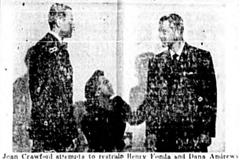
Joan Crawford attempts to restrain Henry Fonda and Dana Andrews in this dramatic scene from 20th Century-Fox's "Daisy Kenyon," showing at the Ritz Theater Sunday and Monday.