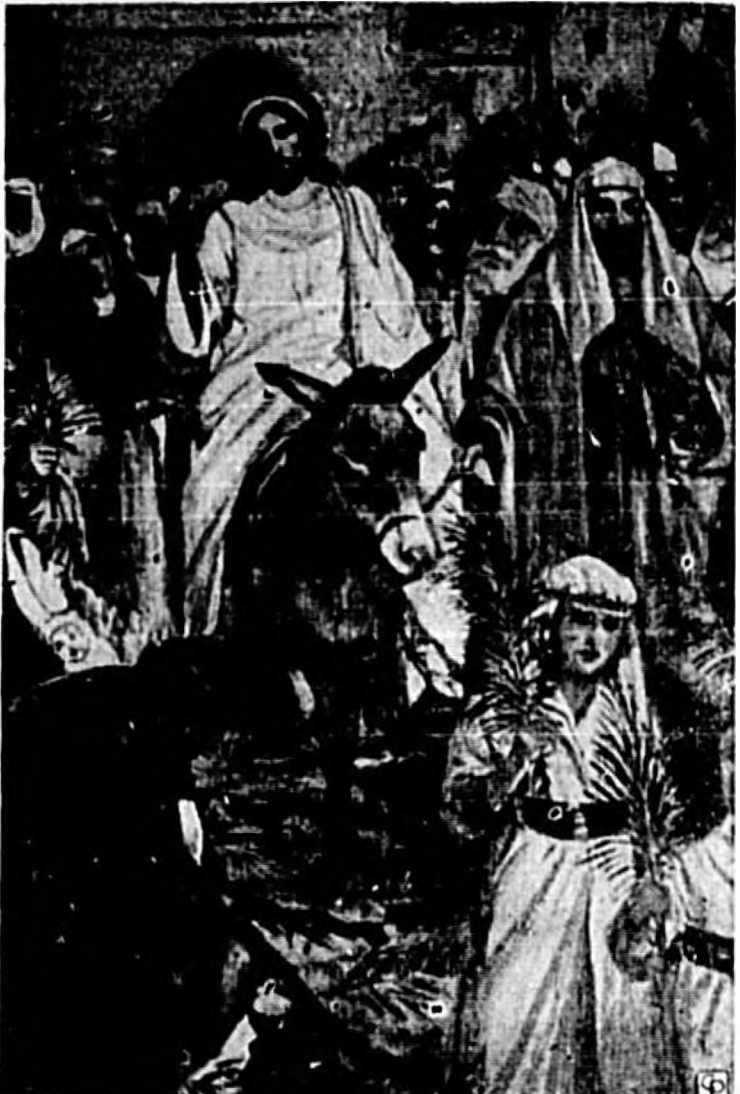
AND THEY that went before and they that followed cried, saying, Hosanna. Blessed is He that cometh in the name of the Lord.—St. Mark 11:9