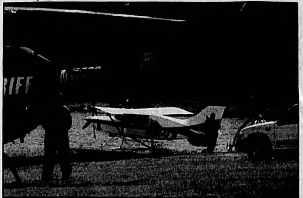
Two F-16 Air Force fighter jets forced down a small float plane Monday about 1:30 p.m. after the aircraft violated a no-fly zone implemented for the launch of the Space Shuttle. The plane did not have wheels and had to land on Lake Golden across from Orlando Sanford International Airport. Two other planes were also forced down at OSIA for failing to adhere to the no-fly zone, a 30-mile radius from the launch site in Cape Canaveral. No arrests were made. Airport officials said all three pilots did not check the day's NOTAMs (Notice to Airmen) which advises pilots of any flight restrictions or special regulations. "It's just a complacent attitude on (the pilot's part)," said Larry Dale, president of OSIA.