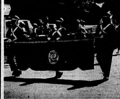
Lake Mary High School's Marching Rams won the trophy for the best musical marching unit in Lake Mary Chamber of Commerce's 60th anniversary parade Saturday.