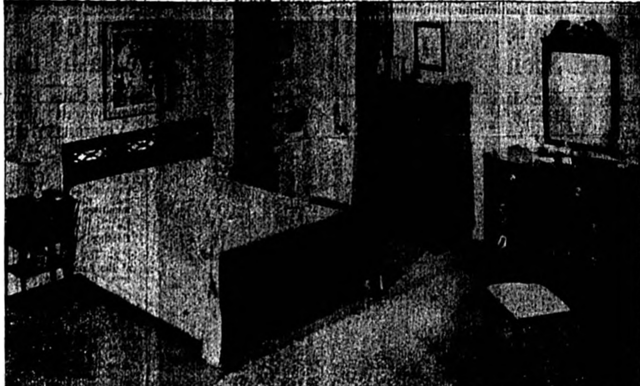
Here's a bit of England transplanted into an American bedroom . . . for the furniture is copied from a famous English style of African mahogany with detailed acanthus-leaf carving on the posts. Bed, chest on chest, vanity or dresser.