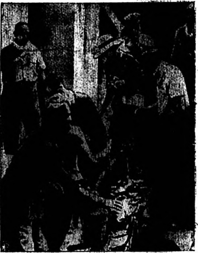
THE PRINCESS OF PIEDMONT, wife of Italy's Crown Prince Humberto, examines the ruins of a bomb-blasted building in Rome following the mid-July raid by U. S. planes. The Princess made a tour of the damaged areas. This photo comes from a neutral source.