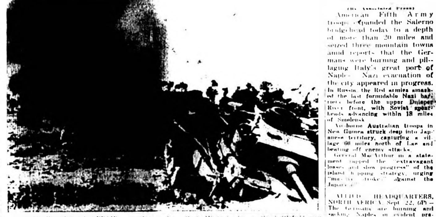
SHATTERED BEYOND REPAIR, a number of Nazi Mark IV tanks lie on the battlefield near Salerno, Italy, after U. S. advances through the smoke and haze. (Official estimates placed the German loss in tanks at forty on the night of the city's liberation.)