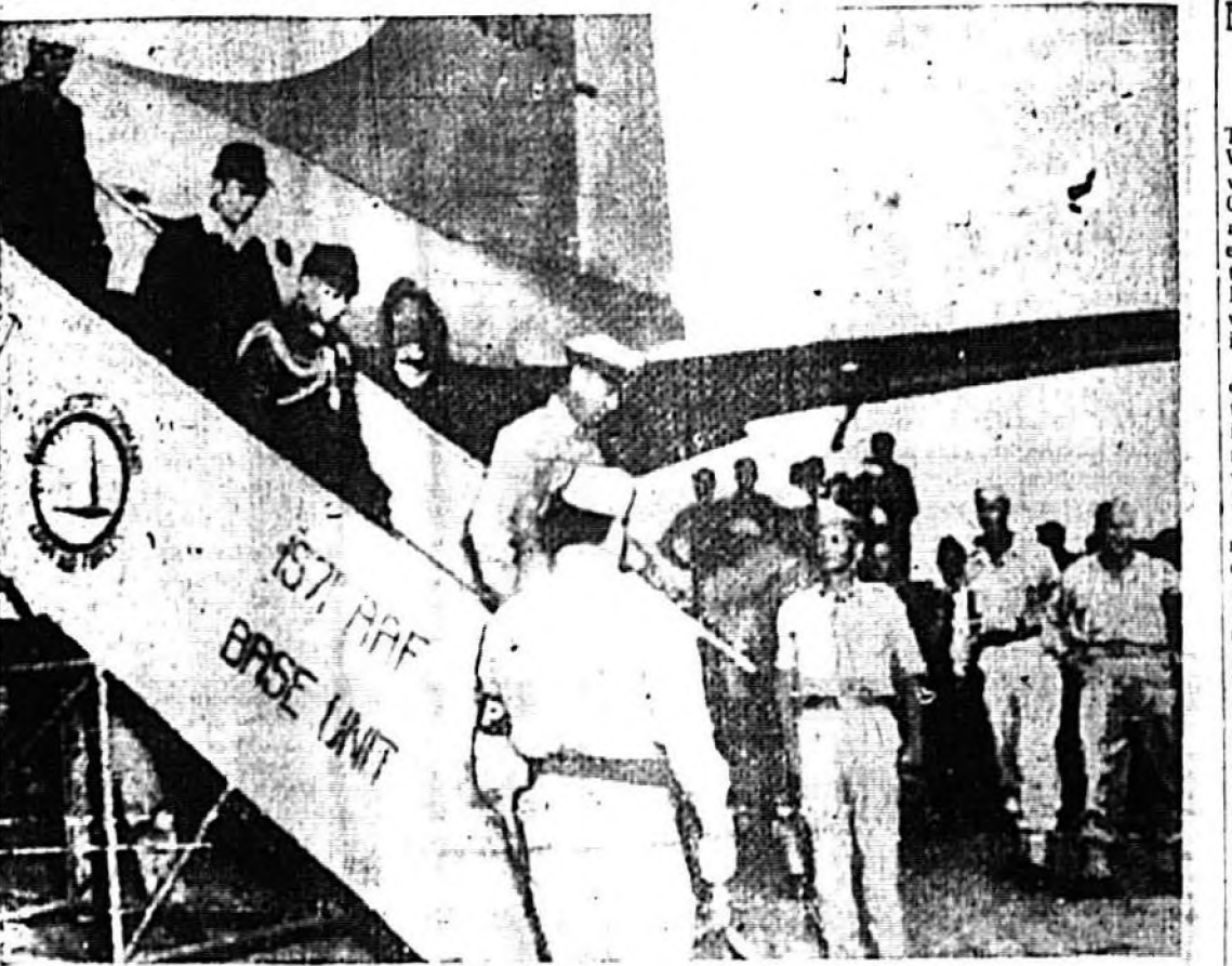
An MP guard flanks the landing struts on a B-24 bomber on the island of Iwo Jima.

KISSIMEE, Aug. 24. (Special) How many cattle are there in Florida? The United States Department of Agriculture's bureau of agricultural economics figures that on Jan. 1, 1945, Florida had on hand 1,150,000 head of cattle.