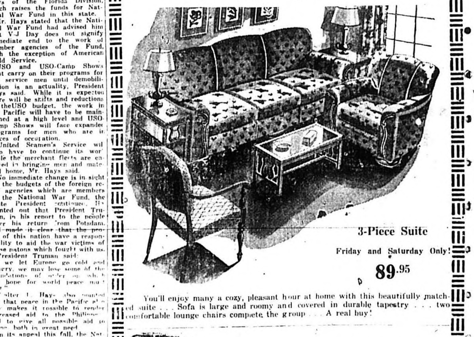
3-Piece Suite Friday and Saturday Only! 89.95