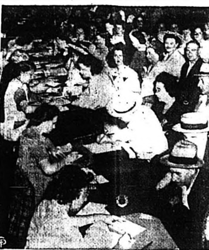
OUT OF JOBS because of the cancellation of military contracts, former war workers through the U. S. Employment Service in Boston in search of new positions or federal unemployment compensation. To spur production, 210 wartime controls were wiped out.

license itself was abolished by the 1945 legislature. Liquors, however, will be able hereafter to get a temporary driver permit, to serve until passage of a road test, without charge from highway patrol after examination on rules of the road. In the past, a 50 cents charge was made for these special permits with restrictions, valid for 90 days. The legislature also increased the cost of the chauffeur's license, covering all persons who drive for compensation, from $1.50 to $2.