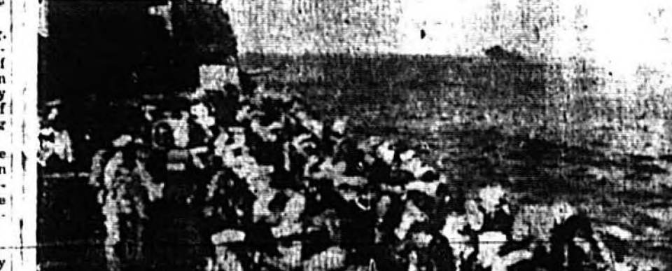
Inspect American Sailors Off Jap Coast