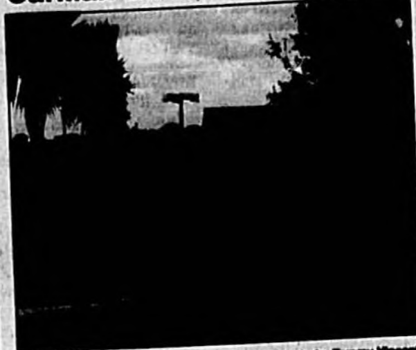
The north end of Pinehart Road is quickly becoming "The Motor Mile," with three new automobile dealerships opening in recent months. A fourth, CarMax is nearly completion of its facility.