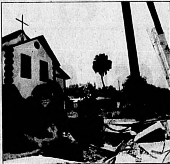
A collapsed stormwater drain at Pine and 6th Street did structural damage to the Victory Temple of God church.

• Decided to continue with United Healthcare insurance coverage for city employees. The city will contribute $299.01 per month for 486 employees, a