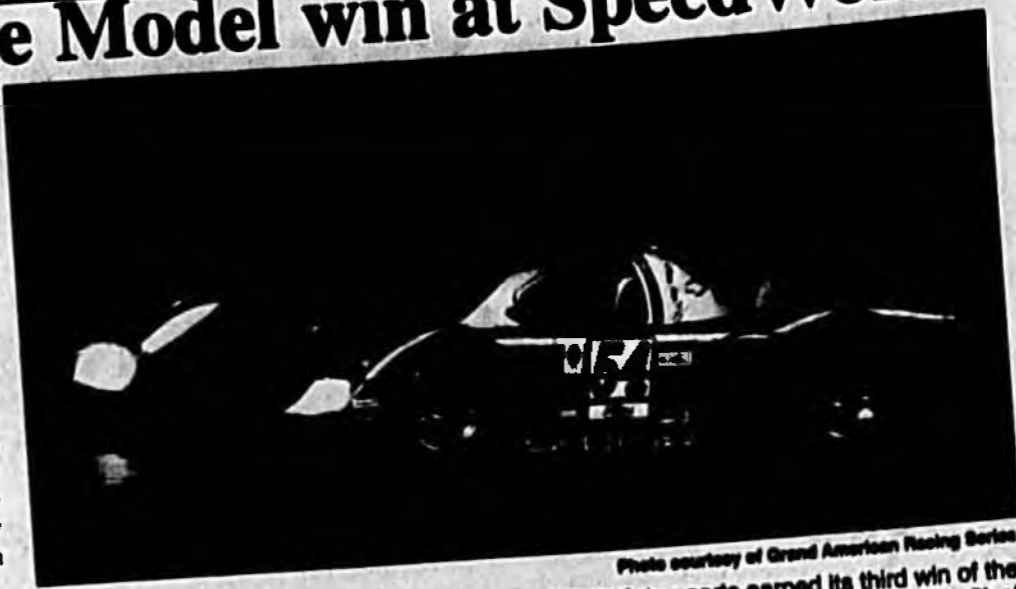
The #54 Chevy Doran J4 Daytona Prototype of Bell Motorsports earned its third win of the season, more than any other team, at the Paul Reverse 250 last Thursday night (July 3) at Daytona International Speedway.