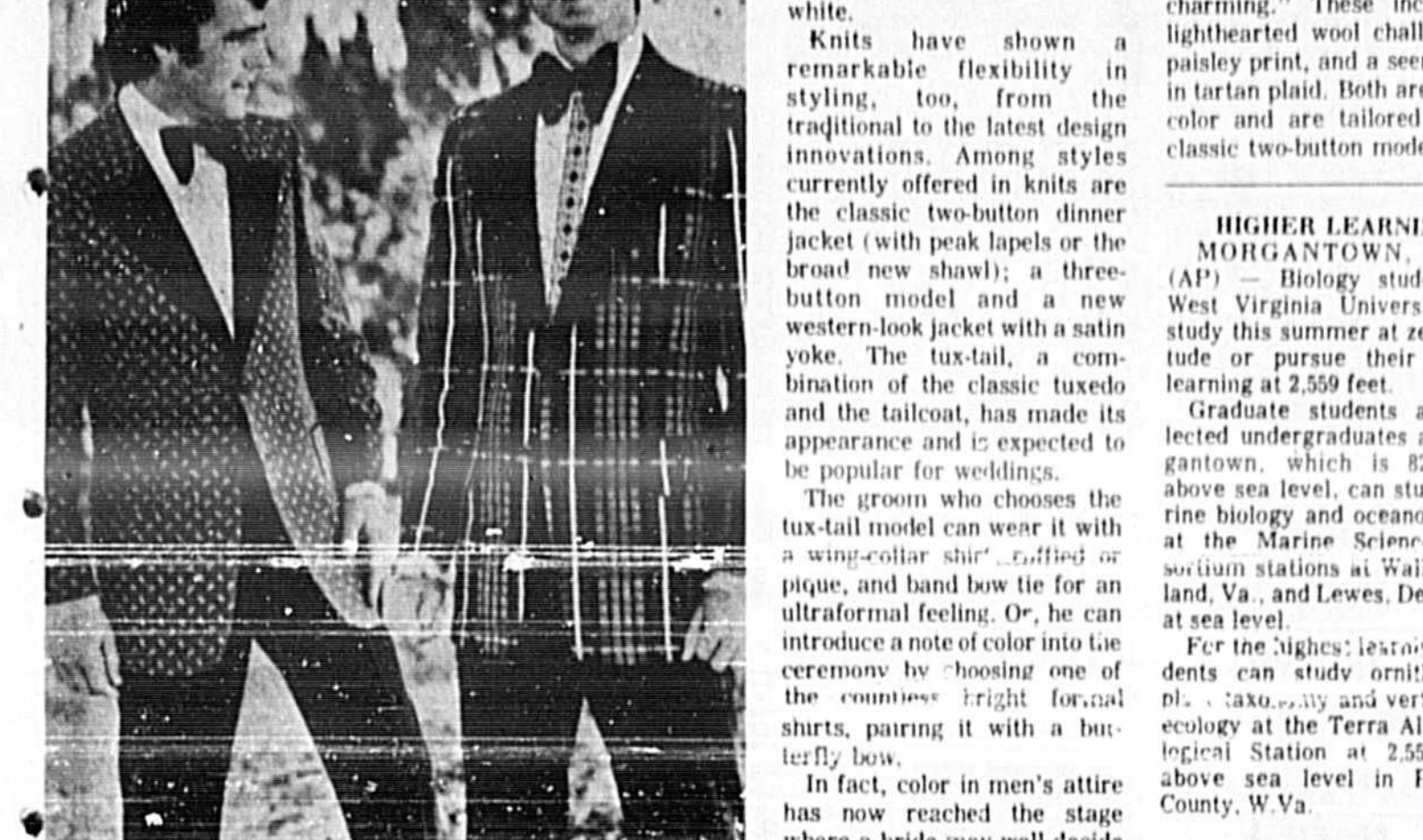
PRINTS CHARMING Plaid and paisley on the formal scene