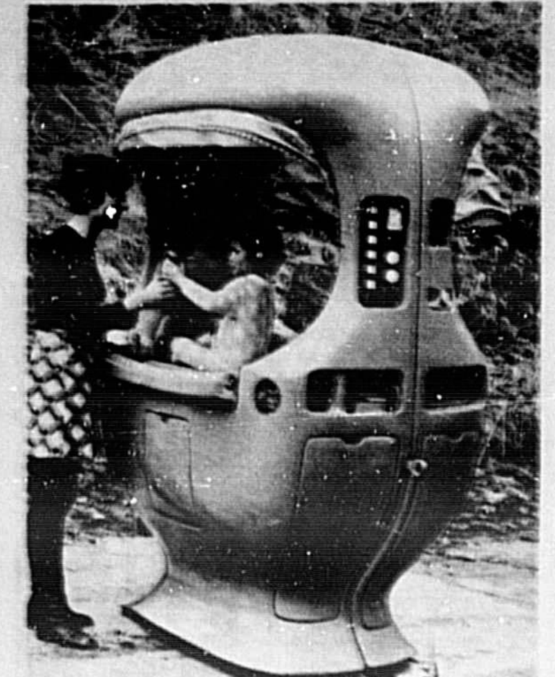
NOV THE SUPER-CRADLE, electric yet, doing its thing in Munich, West Germany. It rocks gently and plays lullabies. Gunter Belling, a furniture designer from Deimhausen, invented for his son Boris. It warms baby's bottle in an upper compartment and sterilizes diapers in a lower one. Pullout shelves store food and keep it warm. A touch on a button lowers dark glass canopies to simulate darkness. You can get one for a mere $2.95.