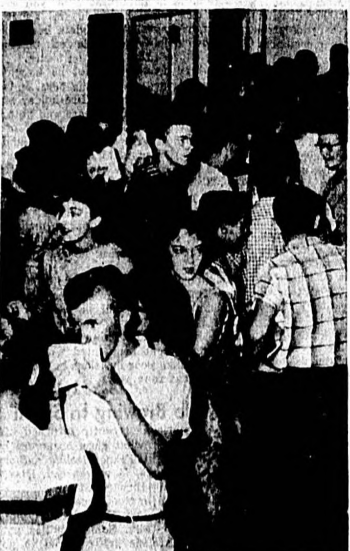
SCHOOL OPENS—Seminole High students, and others in the county, this morning answered the "bell" for the start of the 1958-59 school year. Here, a group reports "a little early" on the first day.