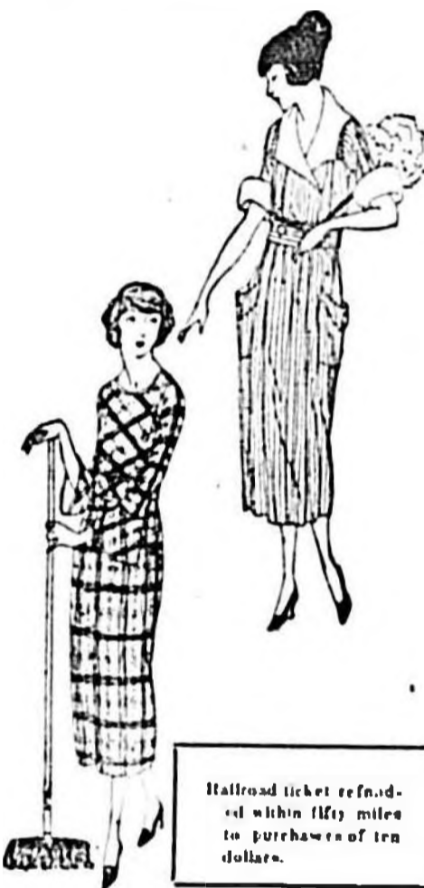
Halfroad ticket refunded within fifty miles to purchasers of ten dollars.