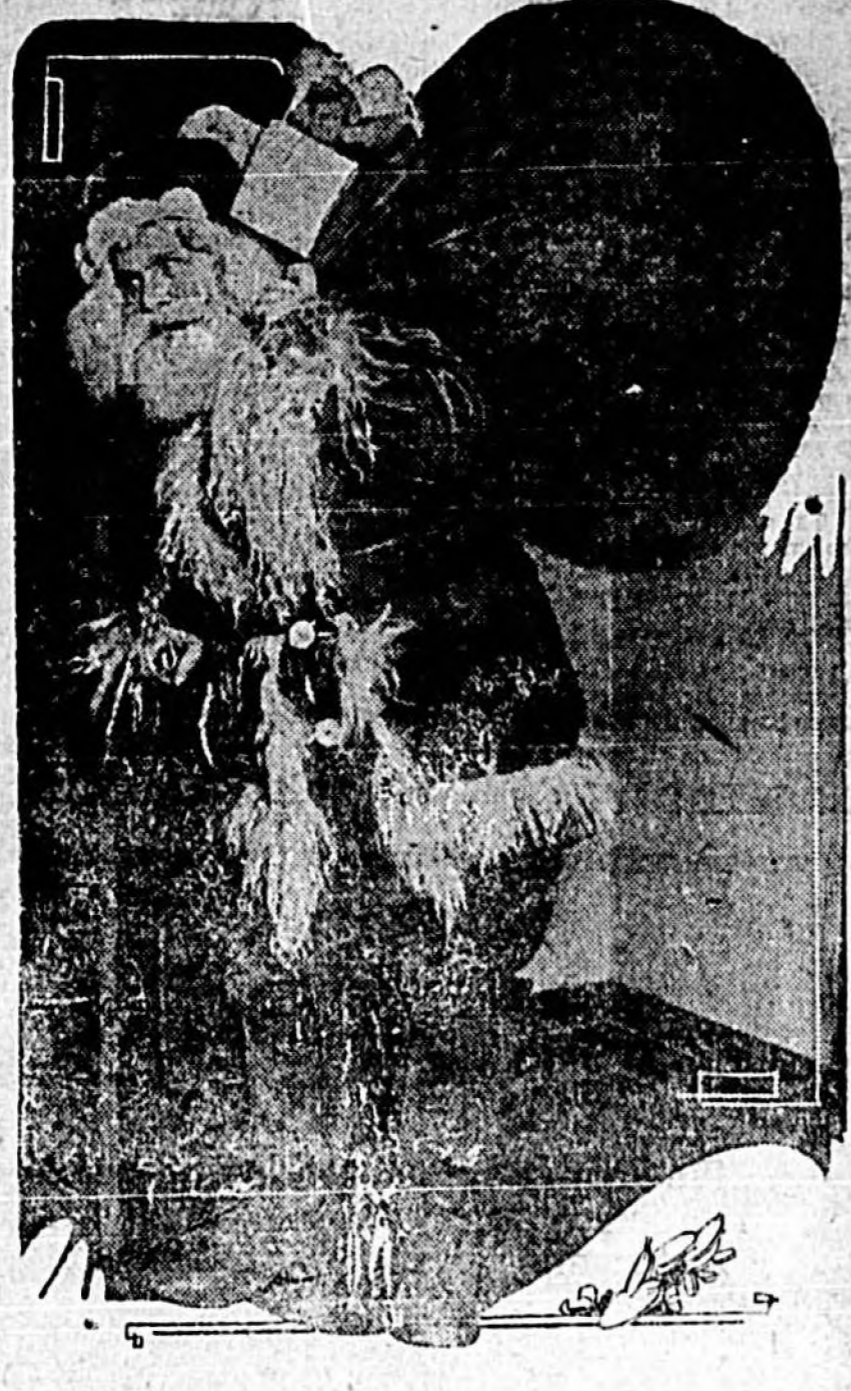
FOR CHRISTMAS DINNER