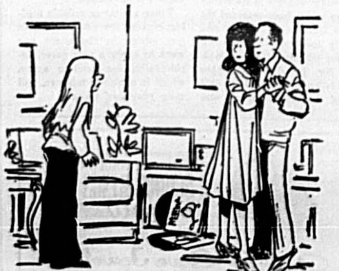
© 1971 by MEL. W. Berry