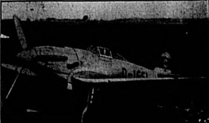
Even cannon take wings in Germany where this single-seated fighter carrying two cannon, two machine guns and six 25-pound split bombs was tested at Rostock. Holes in the wing are cannon outlets. With a maximum speed of 305 miles an hour, guns are handled automatically.