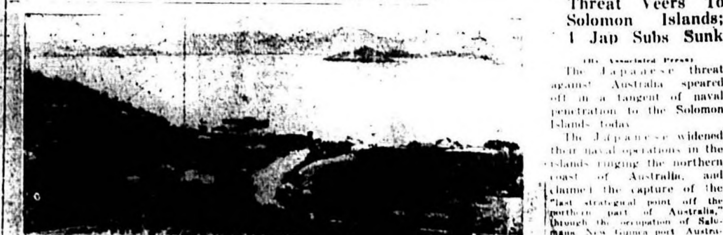
An attack on Port Moresby, New Guinea, about 100 miles from the coast...

Representatives From State Lose Sugar Bill Fight