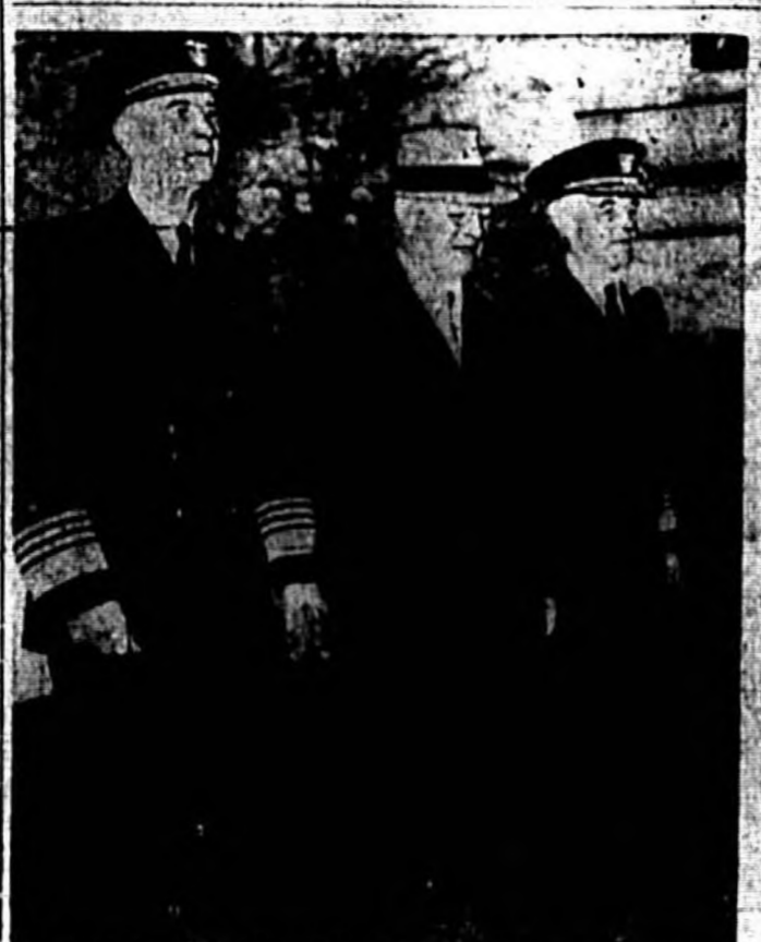
The big three of the U. S. Navy are shown on their way to confer with President Roosevelt on the Far Pacific war situation. Left to right, are Admiral Ernest J. King, commander of the U. S. Fleet, who has been placed in full charge of the Navy, under Knox, Secretary Knox, and Admiral Thomas C. Hart, retired commander of the United Nations naval forces in the Far East.