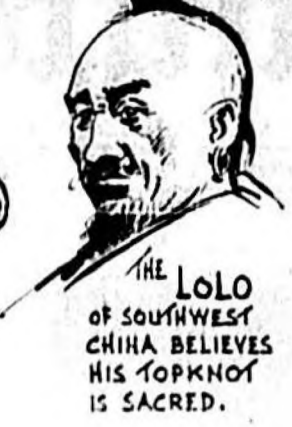
THE LOLO OF SOUTHWEST CHINA BELIEVES HIS TOPKNOT IS SACRED.

SCRAPS HOW MANY POUNDS OF MANGANESE ARE USED FOR EVERY TON OF STEEL THAT IS PRODUCED? 13.