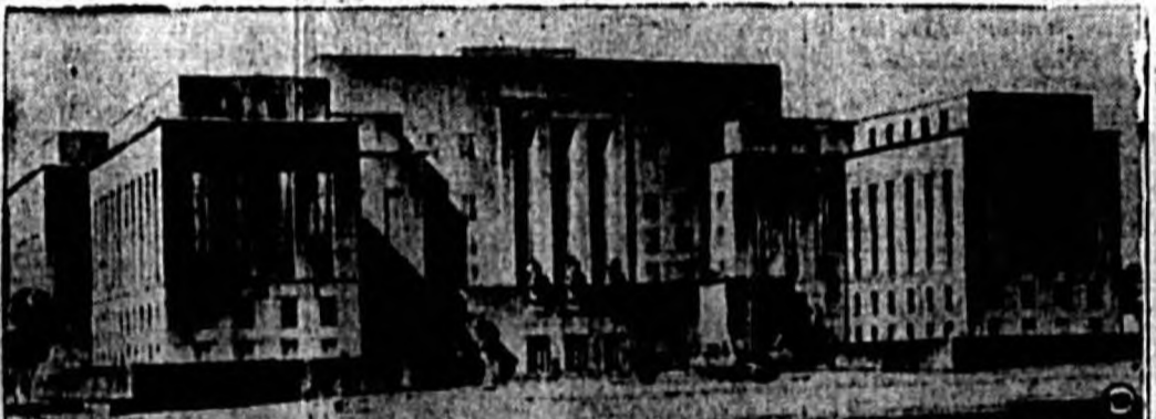
As the U. S. government talks armaments, it also talks about a new home for the War Department in Washington. Above is architects' drawing of proposed new war building with 500,000 square feet of floor space.