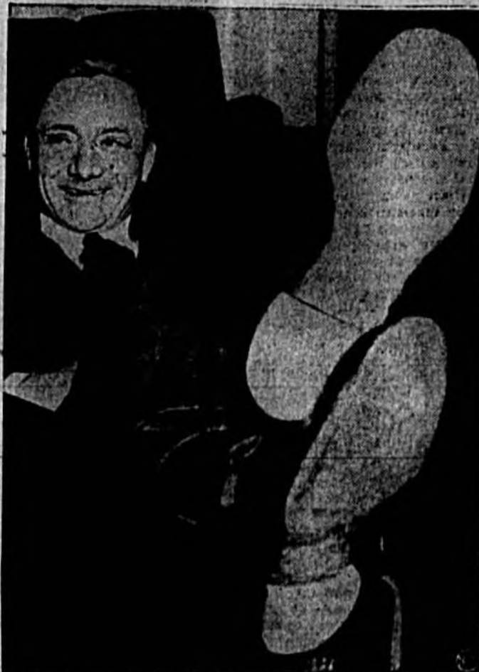
THE MAN behind the feat—40-year-old William O. Douglas, chairman of Securities and Exchange Commission, who was named to the Supreme Court by President Roosevelt, will be youngest justice of high court in 128 years—and maybe one of most relaxed, judging by this informal shot taken immediately after appointment was announced.