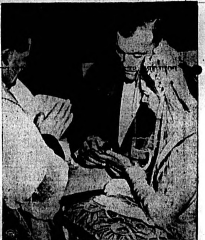
Primo Carnera, massive man whose stature once made him the headline attraction of the boxing ring, helped him reign briefly as heavyweight champ, becomes a husband as he places ring on the finger of Signorina Pina Cavassi, postal employe, at Sequals, Italy.