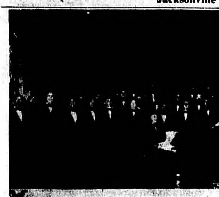
The Jacksonville Male Chorus, one of the leading organizations of its kind in the country, will appear at 8:30 P. M. Friday at the Seminole High School auditorium under the auspices of the Junior Chamber of Commerce. The Chorus is a self-sustaining organization of business and professional men made up of 70 voices. On their varied