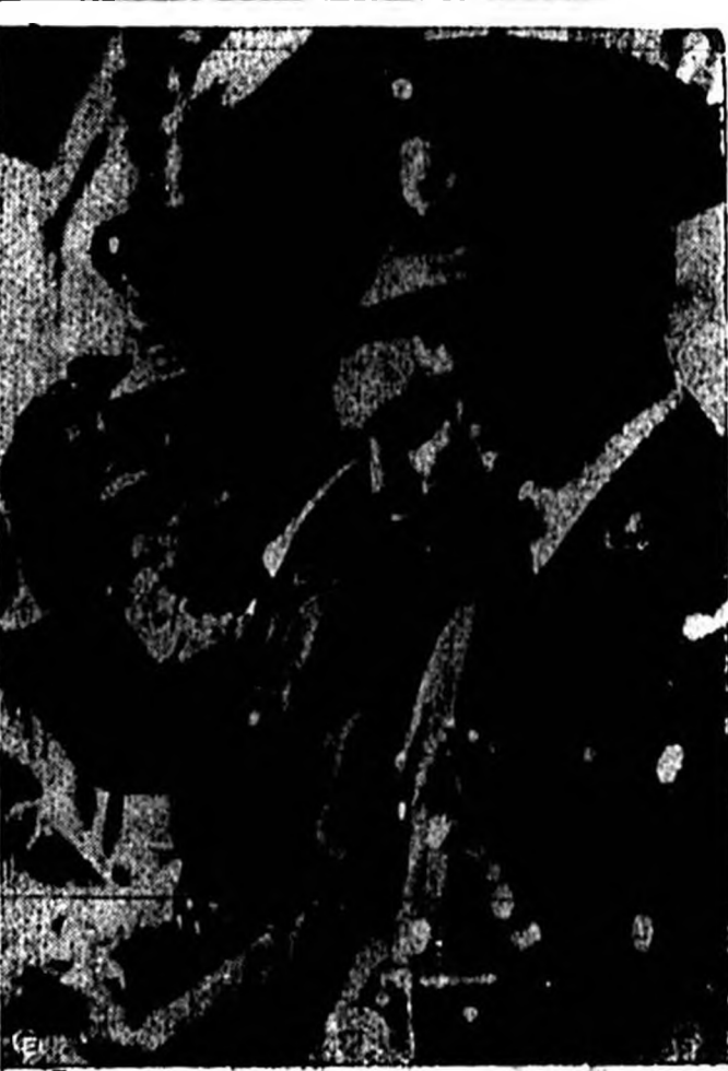
From a balcony of Government House in Buenos Aires, Gen. Arturo Rawson salutes the Argentine flag as the Argentine leaders of the coup.