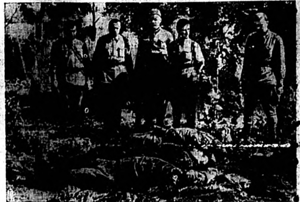
According to the official Russian caption with this photo, which was flashed by radio from Moscow to New York, the bodies in foreground are those of "wounded Red Army men whom the Germans brutally tortured to death on Khorstis Island."