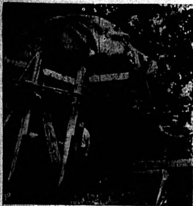
Keepers at Brackenridge Park Zoo in San Antonio, Tex., trying to move Fuschie, the hippopotamus, to a new home, found that the 7,000-pound beast quite definitely didn't want to leave. He's shown almost getting the truck as he tries to leap over the side and return to his old abode. The keepers won out only after a seven-hour battle.