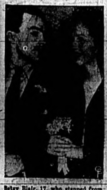
Betsy Blair, 17, who stepped from the chorus of a Broadway musical comedy to a starring role in "The Beautiful People" leaves St. John the Evangelist Catholic Church, Philadelphia, with her bridegroom, Gene Kelly, 27, recent star of the comedy "Pal Joey."