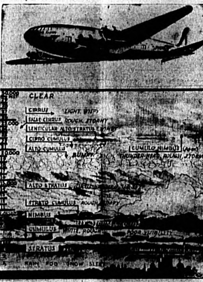
Here's how Pan American Airways' new strato-clipper will get greater speed and flight comfort. The first super-charged, sealed cabin air transport will fly in the thin upper air, operating above the turbulence of weather normally found closer to the earth. The chart indicates the various type of cloud formation and resulting weather—at all levels up to "weather-free" areas above 30,000 feet.