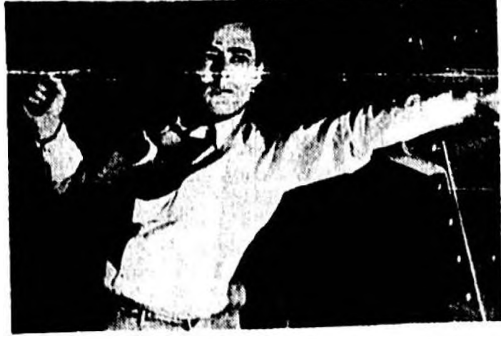
Alan Ladd closes on his man in this scene from Paramount's thrilling new film, "Appointment With Danger," showing at the Ritz Theatre from Thursday and Friday.