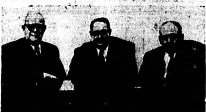
Newly appointed members of the Florida Industrial Commission at their first meeting in Tallahassee.