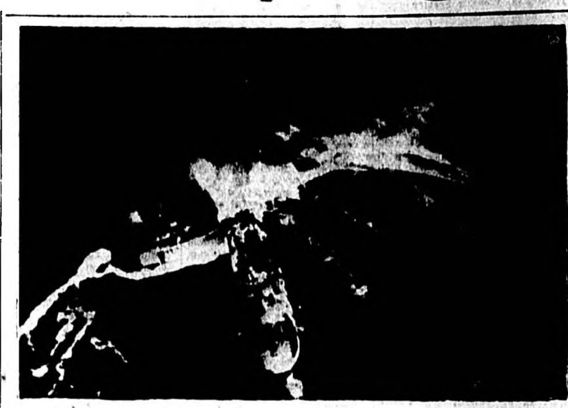
FIFTEEN DIE IN SHIP COLLISION - The coastal tanker S. S. Graham is a blazing inferno after a collision off Ft. Adams, R. I., with the tanker S. S. Gulfoll. Fireboats hug the blazing ship and pour tons of water on her. At least 15 persons were killed, 86 others injured in the collision, which occurred in the ship channel near Newport, R. I.