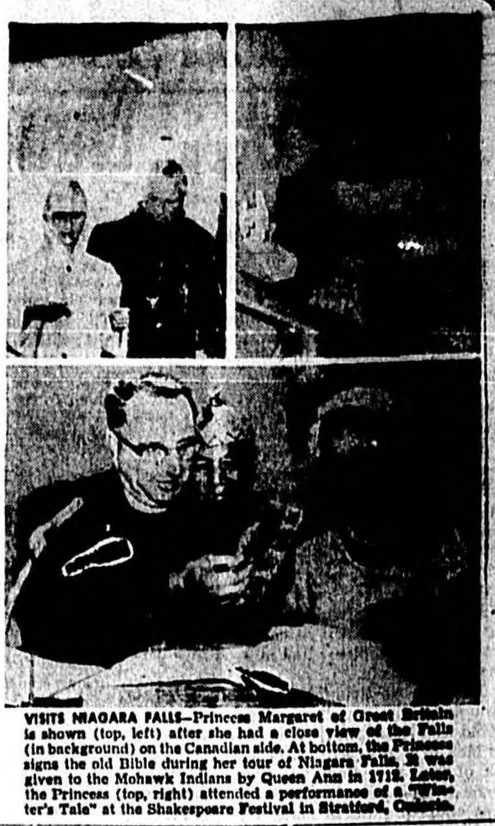
VISITS NIAGARA FALLS —Princess Margaret of Great Britain is shown (top, left) after she had a close view of the Falls (in background) on the Canadian side. At bottom, the Princess signs the old Bible during her tour of Niagara Falls. She was given to the Mohawk Indians by Queen Ann in 1713. Later, the Princess (top, right) attended a performance of "Winter's Tale" at the Shakespeare Festival in Stratford, Ontario.