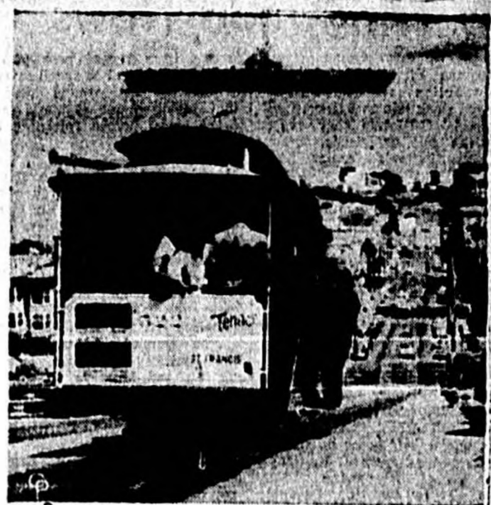
A SIGHT TO SEE —This scene unfolds in San Francisco as a cable car is moving down hill toward the Bay, while the U. S. aircraft carrier Ticonderoga cruises the blue waters. The station is part of the First Fleet, docked off the Golden Gate city. The visit resulted in shore leave for thousands of sailors.

RUSH HOUR CHESTER, Conn.—(UPI)—So many youngsters signed up as extras for a movie being made here that the local supply of Social Security applications was exhausted.