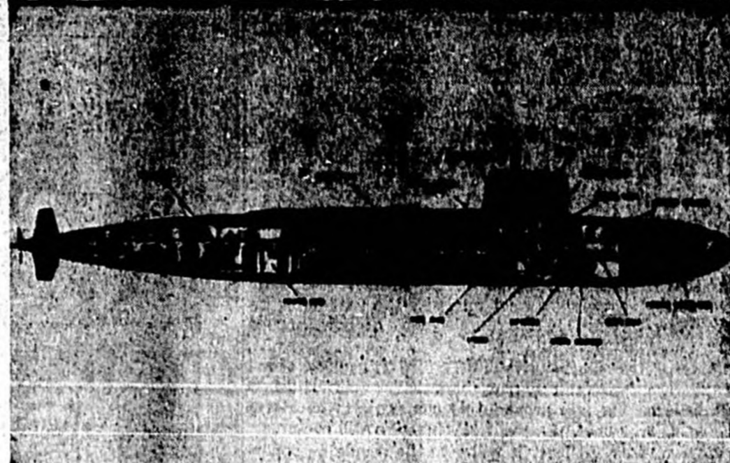
NEW MISSILE SUB —Defense Dept. cutaway drawing of the nuclear powered fleet ballistic missile submarine which is under construction at Groton, Conn. Displacing 5,600 tons, the FBM submarine is 380 feet long. It will be capable of firing the Polaris missile when it becomes operational.