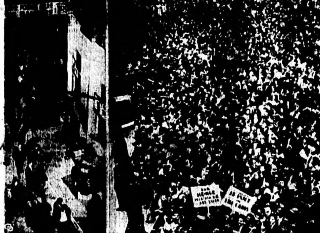
THREATENING SKIES and early morning showers failed to dampen the spirits of hundreds of fans (left), many of whom spent the night just outside the entrance gate to the bleachers at Yankee Stadium, New York. In Brooklyn, one of the largest crowds ever assembled outside Borough Hall (right) gathers to cheer the Dodgers on to victory. An estimated 900,000 persons turned out to take part in the ceremonies.