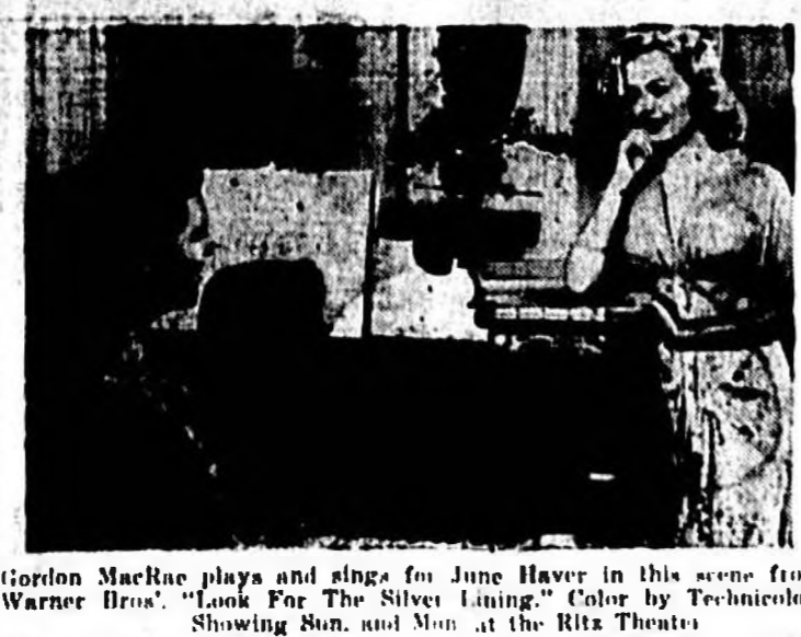
Gordon MacRae plays and sings for June Haver in this scene from Warner Bros. "Look For The Silver Lining."