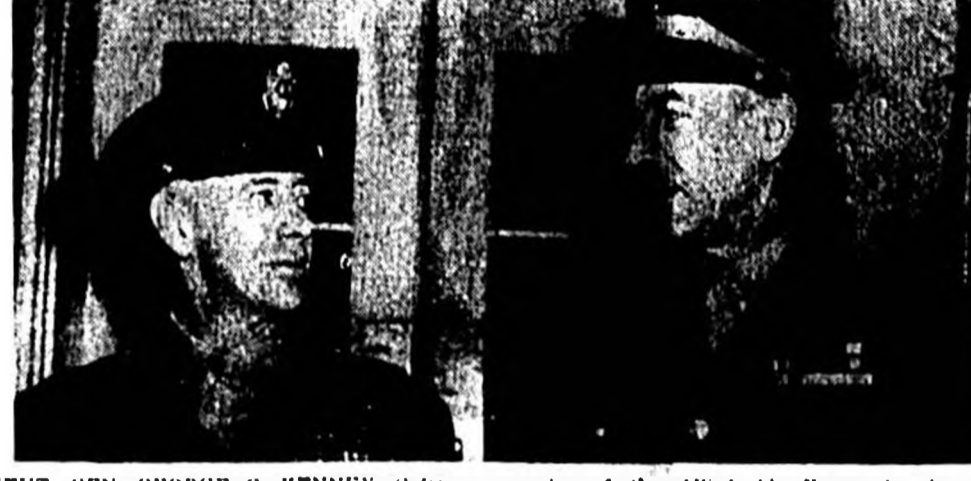
LIEUT. GEN. GEORGE C. KENNEY (left), commander of the Allied Air Forces in the South Pacific area, is shown with Maj. Gen. Richard K. Sutherland, Gen. MacArthur's Chief of Staff, as they left the White House after conferring with President Roosevelt.