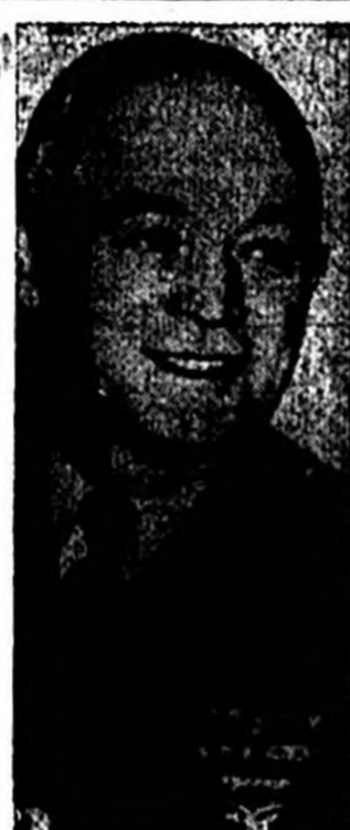
LEUT. GEN. HENRY H. ARNOLD, chief of the Army Air Forces, has been promoted to a full general, thus becoming the first general to hold that high rank.