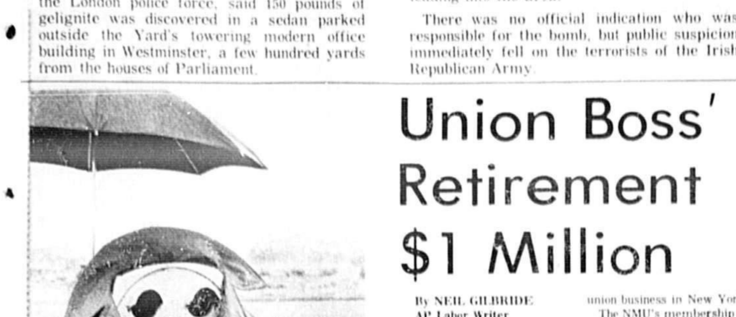
THE SUNSHINE STATE, Florida is called, but when a sightseeing telescope in St. Petersburg wears a rain-coat and packs an umbrella, it kind of makes you wonder.

LONDON (AP)—Two powerful explosions erupted in central London today a few hours after a large unexploded bomb was discovered outside Scotland Yard.