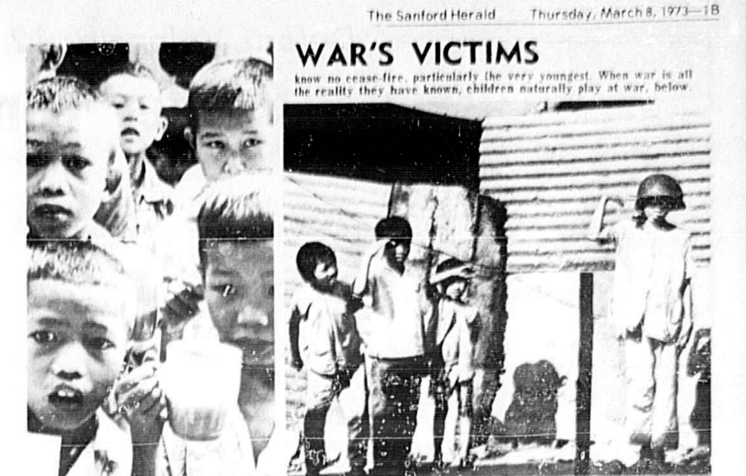
WAR'S VICTIMS know no cease fire, particularly the very youngest. When war is all the reality they have known, children naturally play at war, below.