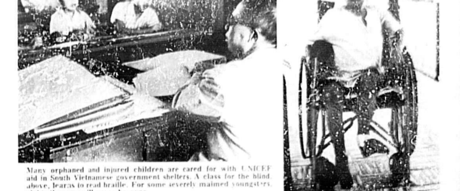
Many orphaned and injured children are cared for with UNICEF aid in South Vietnamese government shelters. A class for the blind, above, learns to read braille.