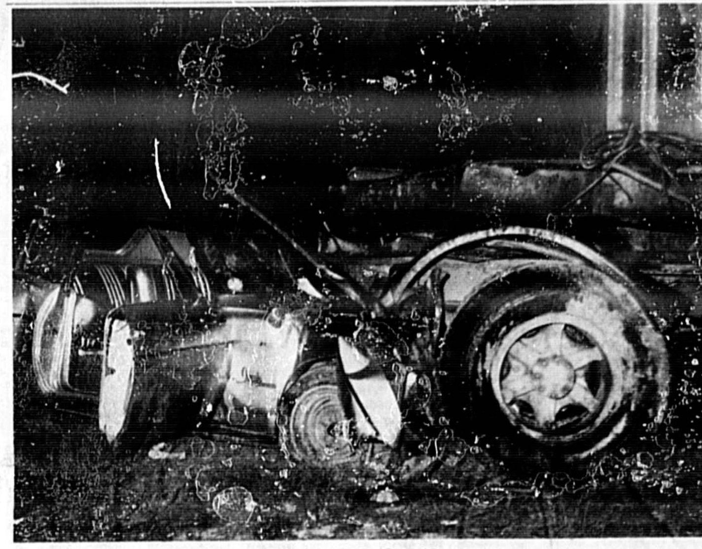
ON RAIN-SLICKENED HIGHWAYS

Cost estimates for 434 from 436 to 14 with full cut and gutter and a 26-foot median was placed at $2,250. Davis said additional right of way is needed on the west side of this section near the Weiva.